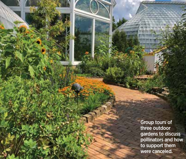
Group tours of three outdoor gardens to discuss pollinators and how to support them were canceled.

Some COVID-19-related losses were unavoidable. Weekend programs about pollinator illustration and orchid-pollinator relationships were canceled to maintain physical distancing and eliminate touchable materials. Group tours of three outdoor gardens where I would discuss pollinators and how to support them were also canceled. The loss that hurt the most was cutting the Summer of Pollinators internship; I was looking forward to working with the intern during one-on-one interpretive interactions with visitors to spark fascination with our insect friends. Luckily, the selected intern received an alternate paid internship at Phipps for the summer.