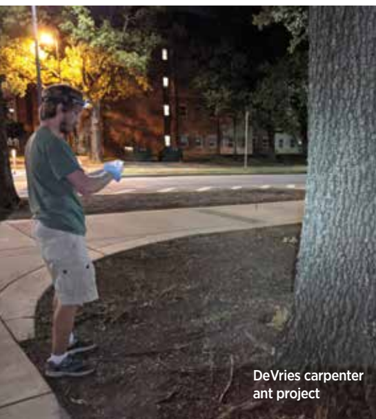
DeVries carpenter ant project

Shifts in assessment and more willingness to post lecture videos online are welcomed changes in my classroom, but the primary benefit from the spring of 2020 has been my willingness to try new things. Nothing about teaching this spring was ideal, but when students see a sincere effort by faculty to connect and deliver quality lectures, they forgive our mistakes—especially when we can laugh at ourselves and move on.