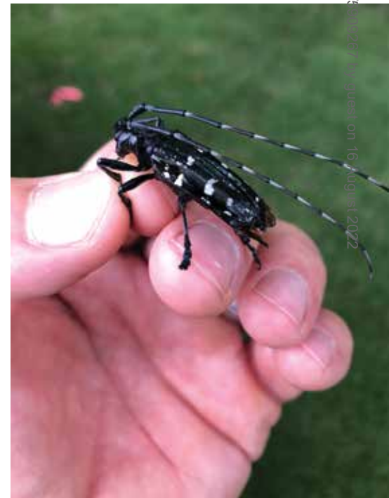
South Carolina became the sixth state to discover an active infestation of the federally regulated Asian longhorned beetle.

there" for meetings, field days, and site visits, but I've learned it's not the end of the world if I'm not somewhere, or if that thing doesn't get done, or that e-mail doesn't get answered. I have two little kids; this is the most I've been home in years, and the irreplaceable family time is glorious! I was once told that family has to come second during pre-tenure, that I had to get tenure at all costs, and that I would have to rely on my wife to shoulder the majority of work at home. I thought that was misguided, archaic bulls••• then, and even more so now. This whole situation has been challenging, but I wouldn't trade it for anything.