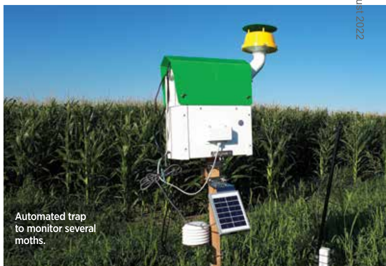
Automated trap to monitor several moths.

The pandemic has revealed how online conferences can connect researchers across the globe while they are at home. The International Branch hopes that our virtual symposium helps maintain relationships and facilitates scientific exchanges between all members of ESA, no matter what country they work in. Regardless of when the pandemic ends, we are preparing for the fourth International Branch Virtual Symposium (26–28 April 2021) and plan to highlight invasive species and insect-plant interactions.