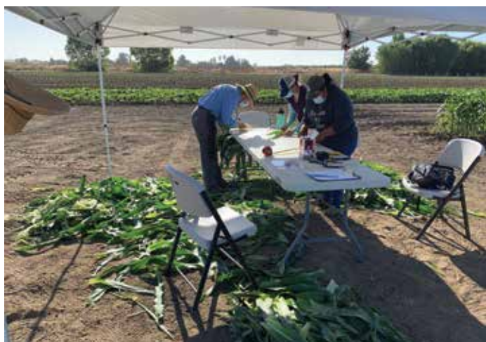
Corteva entomologists count insects while wearing masks to protect each other from COVID-19 exposure.

Technology development requires a constant cadence of decision-making, relying on the coordination of many scientists who conduct year-round field, greenhouse, and lab studies. For entomological studies, samples of seed, chemistry, and insects are materials essential for research. A rapid first step was to prioritize research assignments and identify essential personnel who required access to facilities. Limiting the number of individuals allowed on site