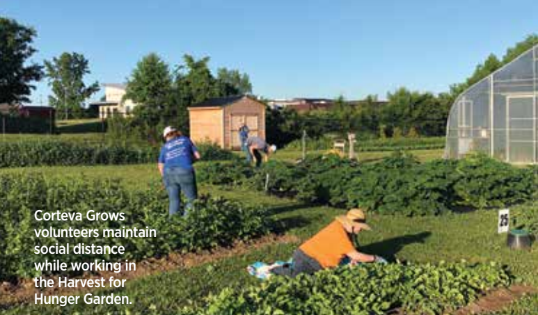
Corteva Grows volunteers maintain social distance while working in the Harvest for Hunger Garden.