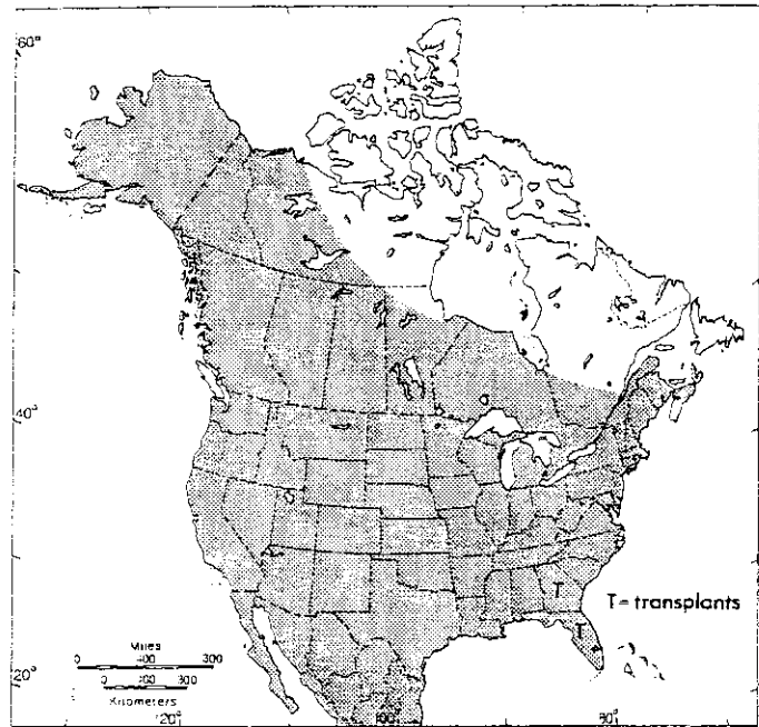
FIGURE 22.1. Distribution of the coyote ( Canis latrans ).

Coyotes are often confused with other canids, such as gray wolves, red wolves ( C. rufus ), and domestic dogs. Coyotes can successfully interbreed and produce fertile hybrids with all these species (Dice 1942; Kennelly and Roberts 1969; Kolenosky 1971). However, coyotes can usually be differentiated (although overlap and hybridization can occur) using serologic parameters, dental characteristics, cranial measurements, neuroanatomical features, diameter of the nose pad, diameter of the hind foot pad, ear length, track size, stride length, pelage, behavior, and genetics (for reviews, see Lawrence and Bossert 1967; Bekoff 1977a; Elder and Hayden 1977). For example, coyotes are typically