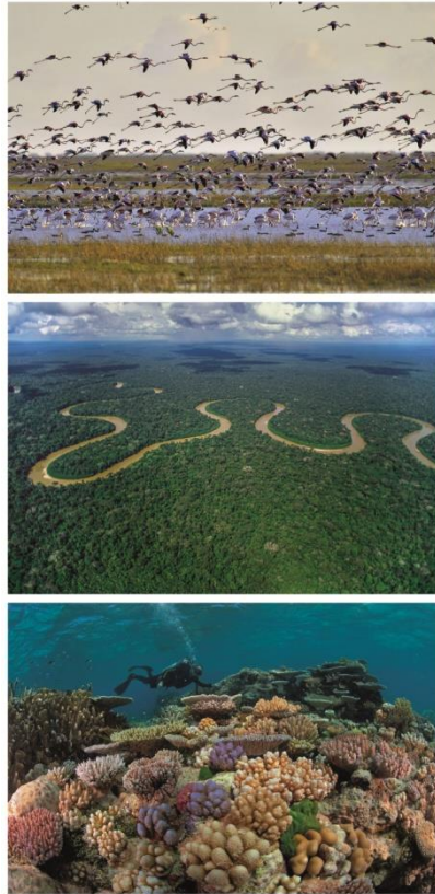
Fig. 2. Examples of iconic ecosystems where climate change may trigger transitions to a different state. From top to bottom: the Doñana wetlands, the Amazon rainforest and the Great Barrier Reef (credits from top to bottom: Jorge Sierra; André Baertschi / wildtropix.com; David Doubilet, National Geographic Creative).