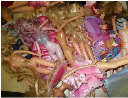
Figure 5: Examples of objects in 'Unpack Barbie' session

opportunity and a safe learning environment in which students can develop the critical thinking, questioning and visual literacy skills which are the intended outcomes of the session. This example of object-based learning in practice is a good example of 'reflection in practice,' as identified by Schön (1983) where students reflect, evaluate and take action through making decisions during the object handling activity. 'Unpacking Barbie' has been successful for the LCF Library and Academic Support teams and is now in its third year. Feedback suggests that, as a result of taking part in the workshop, students feel that they have acquired new research skills and talk fondly of the experience and how they have used the library and will continue to do so throughout their studies.