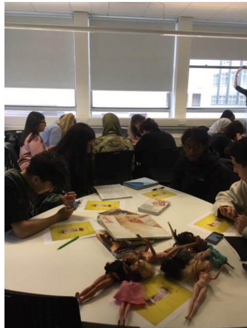
Figure 6: Students in 'Unpack Barbie' session