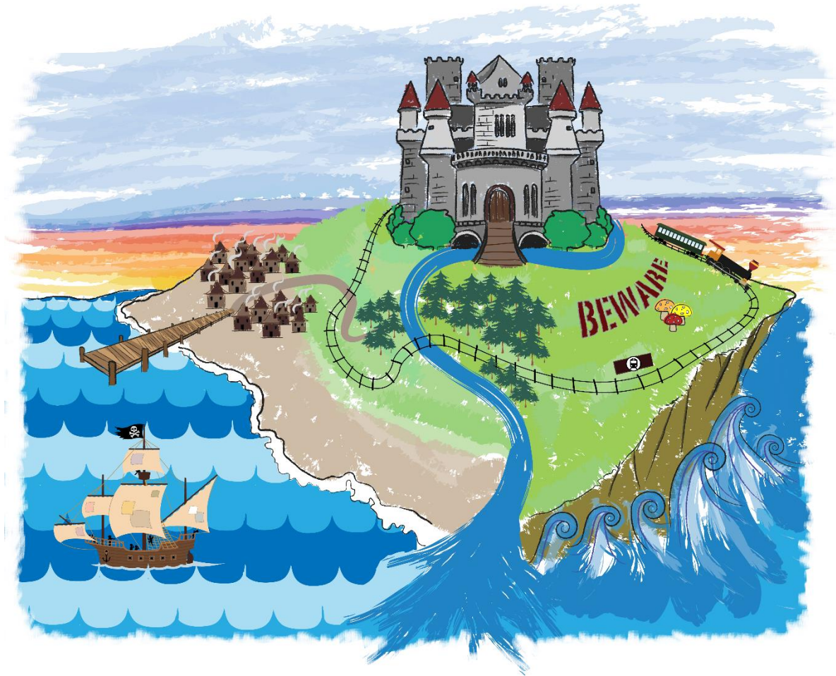
Figure 2. Interactive Image from “Streams Slipping in the Dark”.

parchment-and-ink), with a two-dimensional aspect. The final image that I created (Figure 2) instead carries a more whimsical, child-like tone, calling to mind pop-up storybooks in its depth and color, immersing the reader in the fairy tale world through Benjamin’s “primal phenomenon” of color [26] (p. 442). It carries forth the fairy-tale aspect of the narrative through to the imagery, and illustrates (though not explicitly) the truth underlying the narrative itself: that the world is created in the dreaming mind of a child. The effects of illustration and depth, instead of flat, representative map-space, invite the reader to explore the map. They offer a space within which the reader can travel him/herself, rather than merely following a dotted line of the characters’ travels. The further the reader moves into the image, the more narrative they discover, moving with the characters rather than observing from a distance.