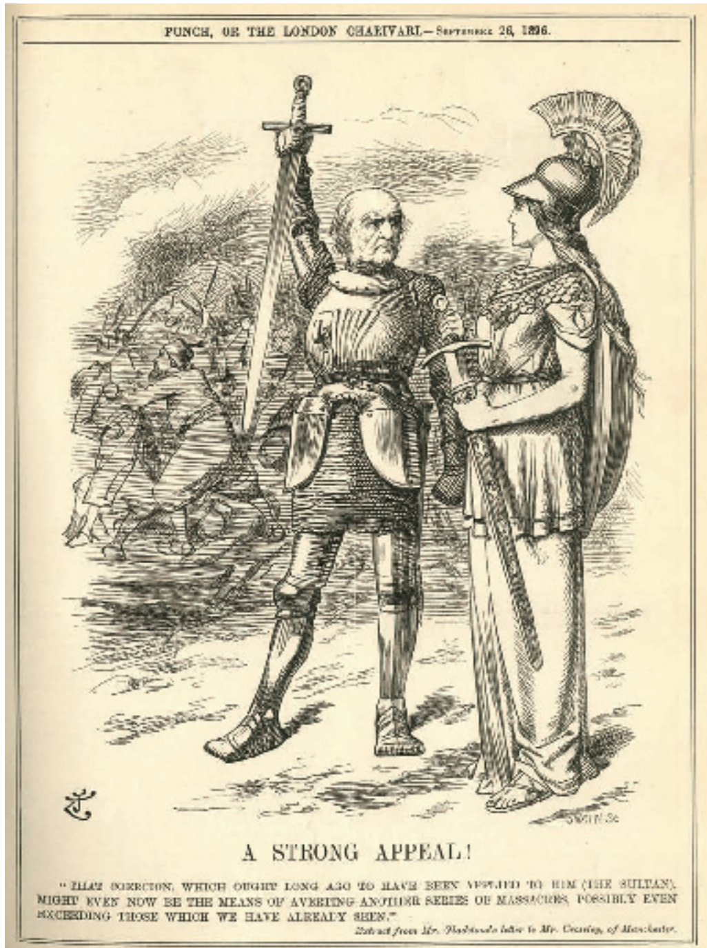
FIGURE 1: Gladstone (shown here as a Christian crusader) and Britannia defending civilians from massacre. From Punch , September 26, 1896, 151.