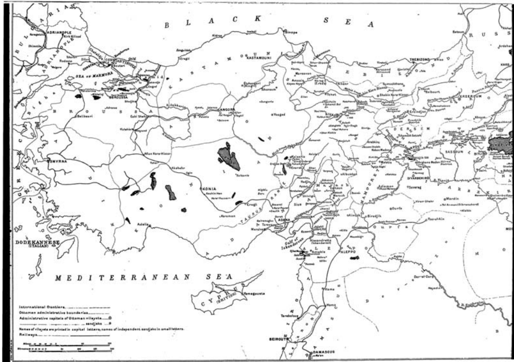
FIGURE 2: General map of the western Ottoman Empire published at the beginning of the Blue Book, indicating international frontiers, Ottoman administrative boundaries, capitals, villayets, sandjaks, and railroads. From Viscount Bryce, The Treatment of Armenians in the Ottoman Empire, 1915–16 (London, 1916).

sketches made by a British consul stationed in the region. 63 In 1915, more thorough regional surveys, coupled with the support of a Foreign Office that fully realized the propaganda potential of the Blue Book, gave Bryce the resources necessary to assemble and disseminate a detailed atrocity map that charted even the smallest vilages around the main sites of the massacres. Readers could locate the sites described in the documents and trace the route of the Anatolian Railway, along which tens of thousands were deported by train and on foot through the desert. 64