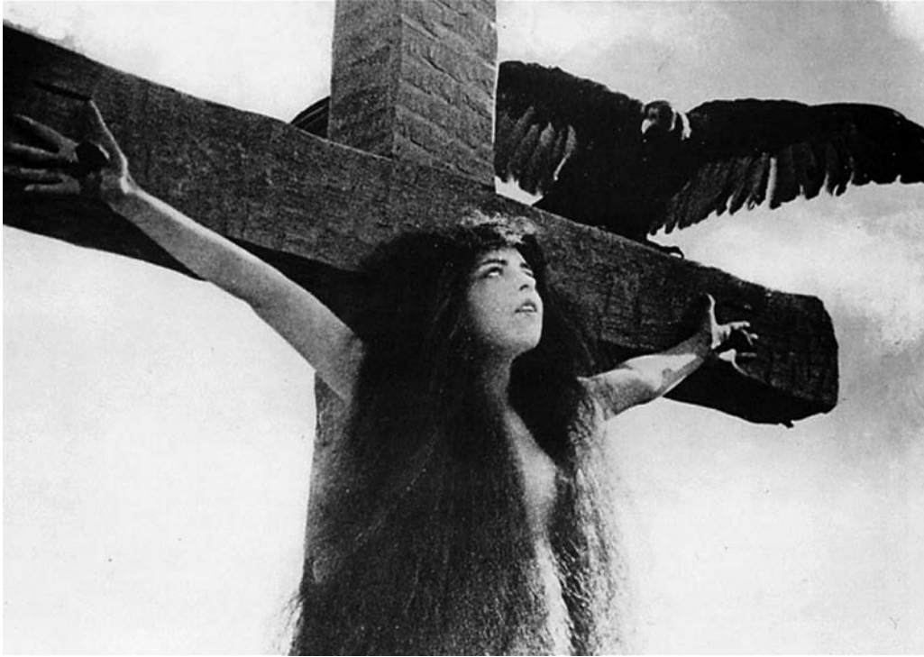
FIGURE 4: Mardiganian in a crucifixion scene from Auction of Souls . Only a fragment of the film exists, which has been restored by the Armenian Film Foundation. Still from Ravished Armenia , courtesy of the Armenian Film Foundation, Los Angeles, California.

before known.” Film as a visual modern medium, according to Robert Rosenstone, has “its own rules of representation” when compared to other media. 122 Humanitarian organizations, most notably Save the Children, would learn how to mobilize film’s visual realism in the 1920s to raise funds and to make the case for intervention. 123 However, the shocking content and newness of the atrocity film as a genre in 1919 made it suspect as a tool for promoting humanitarian ideals and action. This was particularly true of the showing of Auction of Souls in Britain, where authorities remained concerned about film’s ability to manipulate viewer sentiment and possibly incite violence. 124 Promoters carefully represented this Hollywood realist drama containing both graphic violence and sexual content as having a “nobility of purpose.” This positioning of Auction of Souls played to standards set by the National Council of Public Morals Cinema Commission, which had been founded during the war to regulate film content in Britain. The change of the title of the film and book to Auction of Souls for British audiences from the sexually charged U.S. title, Ravished Armenia , more clearly conformed to the council’s guidelines, which assigned films