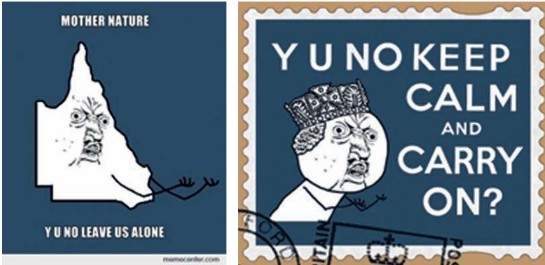
Figure 12: Y U No crisis meme examples.

imprecation for the rioting from the perspective of those (within or outside) who hold a particular stereotypical viewpoint of British society as typified by calm and the ‘stiff upper lip’ sentiment.