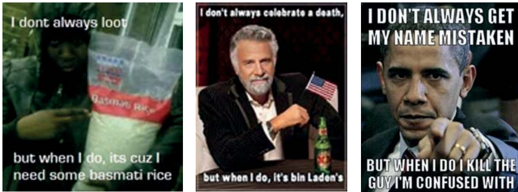
Figure 5: The Most Interesting Man in the World crisis memes.

version contains both right-wing and left-wing critiques. By playing up the issue of the US political right harping on the coincidental similarity of his name to that of Osama Bin Laden, the image paints his hardcore action as petty. But it also takes a left-wing perspective, painting action that might be desirable to the right as a potentially unconscionable over-reach of power.