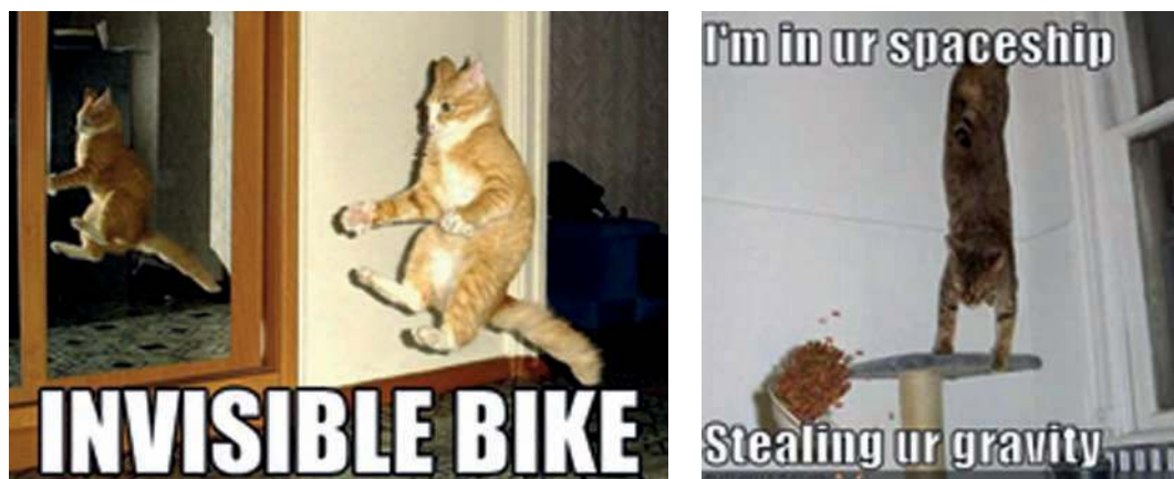
Figure 3: LOLcat snowclones.

Happy Cat also set a standard for an idiomatic pidgin that has come to be referred to as 'LOLspeak' with remarkably robust rules (Dash 2007). Historically, language play has been a staple of typographic Internet communication (Crystal 2001), and this heightened sensitivity to play with language patterns is particularly important to meme development. Apart from image macros, the other fundamental building block of online memes is the language template termed 'snowclones' (Know Your Meme 2011l). Unlike LOLspeak, which is based around particular grammatical patterns with some common content themes, snowclones are more direct verbal templates.