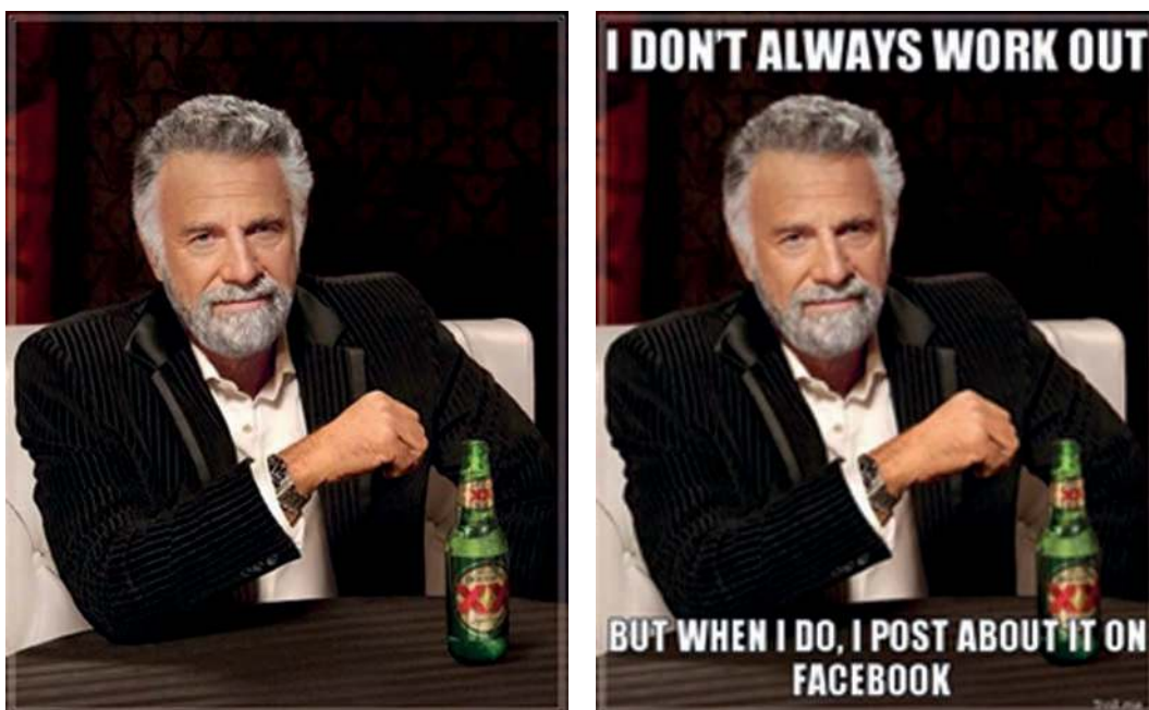
Figure 4: The Most Interesting Man in the World original and meme example.

The original version is an image macro snowclone based on the Dos Equis beer brand advertising campaign centering on 'The Most Interesting Man in the World' (Know Your Meme 2011f). The man (Figure 4, left) illustrated male power as cool, self-satisfied and defiant of societal norms. The man's exploits are so epic in scale that his choice of beer is epic by association (I don't always drink beer, but when I do it's Dos Equis ). Although the campaign nominally rests on the audience recognizing the man's power, the audience is also supposed to take an ironic position towards the man: he is impossibly powerful and hence as much a figure of ridicule as respect. In the meme version (Figure 4, right), the notion of power is conveyed through the image of either the man himself or any figure that can be easily depicted through mid-shot image. This is combined with a snowclone version of the campaign's tag line: 'I don't always <verb phrase1>, but when I do, <verb phrase2>' with the phrases positioned as setup at the top and punch line at the bottom. However, the meme version usually emphasizes the original campaign's ironic position by using the punch line to show the figure as ridiculous.