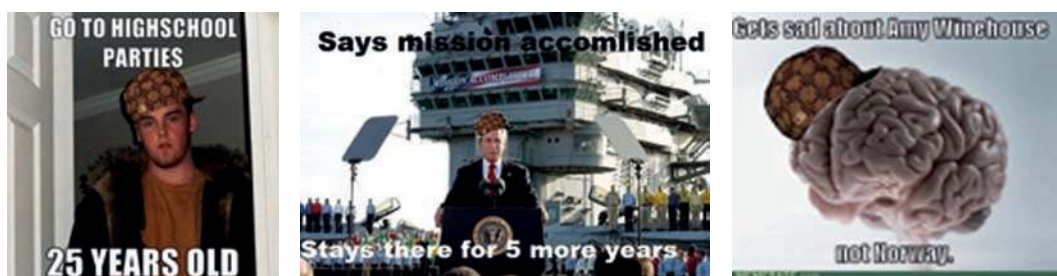
Figure 14: Scumbag Steve original meme example, crisis meme example and reflexive crisis meme example.

The moral dimension of this Scumbag Brain example also brings up the issue that different sites of meme production have very different standards as to what is considered acceptable. Know Your Meme pages on individual memes frequently mention 4Chan in early origin reports e.g. Chubby Bubbles Girl. 4Chan was designed to be an anonymous image-sharing forum in which users could post without restriction. Users in the/b/forum are notorious for their resistance to traditional morality (Knuttila 2011), this, combined with a