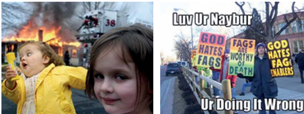
Figure 13: Disaster Girl and Chubby Bubbles Girl; LOLspeak and You’re Doing It Wrong.

As well as their own direct and fairly simple meaning, memes draw representational power from their association with one another. For example, when a new exploitable appears, it is common to find it combined with other exploitables with similar themes such as the combination of Disaster Girl and Chubby Bubbles Girl (figure 13, left). Similarly, a striking photograph can be used in conjunction with several verbal memes, as in the combination of LOLspeak with the ‘You’re doing it wrong’ meme superimposed over the image of homophobic Westboro Baptist Church protestors (Figure 13, right).