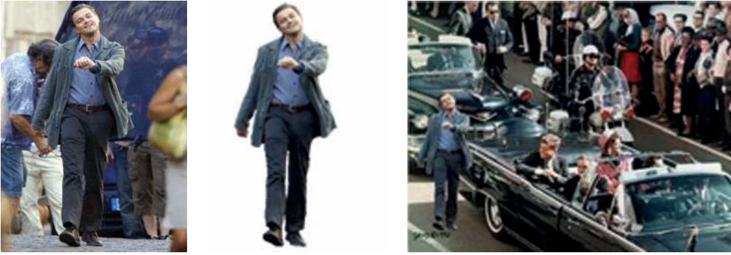
Figure 8: Strutting Leo original, exploitable and crisis meme example.