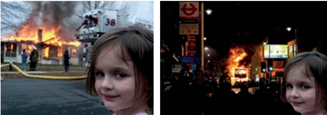
Figure 9: Disaster Girl original and crisis meme example.