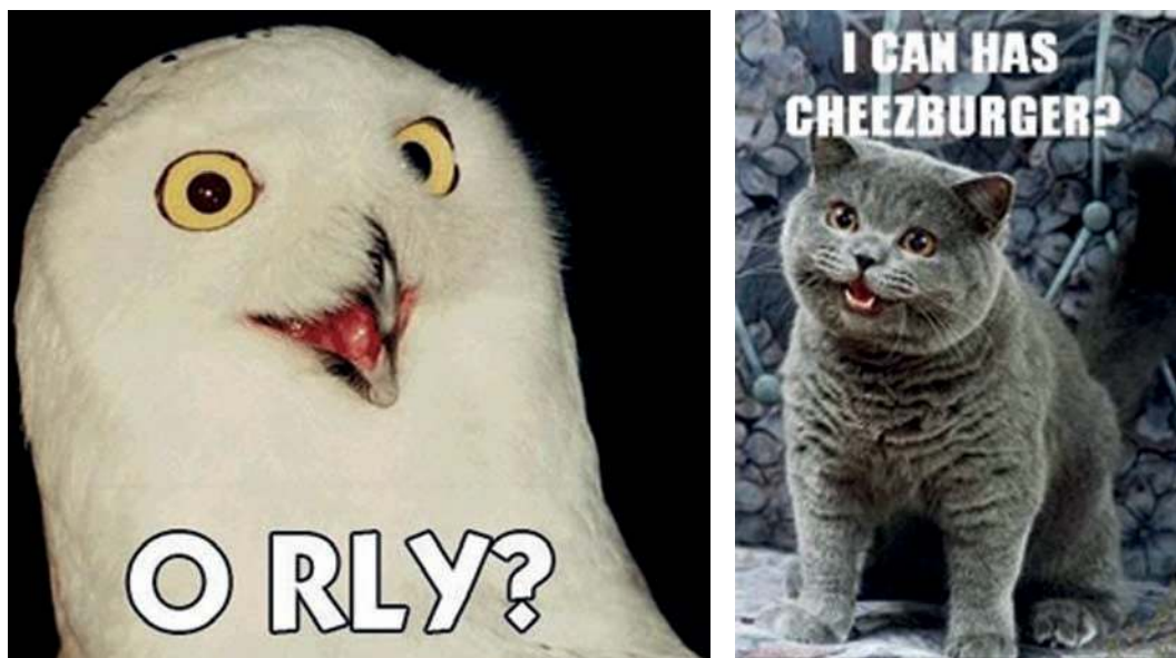
Figure 2: Classic image macros: O RLY? and Happy Cat.

superimposed text (Wikipedia 2011a), conforming to a template for their combination and types of meaning. The images are usually striking representations of an action or emotion, often taking the form of a human, anthropomorphized animal or object. The text of the caption is usually in large point size Impact typeface coloured white with a black outline. The words are often written using Internet orthographic alterations.