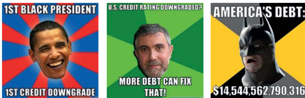
Figure 7: Advice Animals crisis memes.

(Figure 7, left), economist Paul Krugman (Figure 7, middle) and even Batman (right) were used to critique the left-wing position.