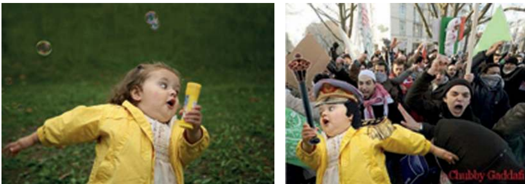
Figure 10: Chubby Bubbles Girl original and crisis meme example.