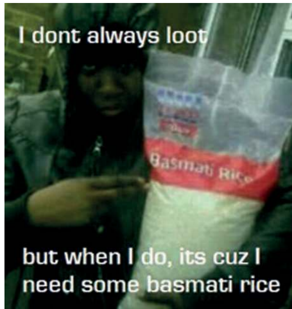
Figure 1: UK riots crisis meme.

Similar posts can be found for several recent crises, ranging from natural disasters (the Queensland floods), policy crises (the US debt crisis), terrorism (Norwegian mass killings), through to celebrity deaths (Amy Winehouse). Even given the large number of potentially creative people in the world, just how is that such posts are so readily produced? The answer, of course, is that most are not created from whole cloth. Rather, they are image macros, which are one form of online memes: thematically and formally replicated trends in online behaviour. Michele Knobel and Colin Lankshear's detailed thematic analysis of nineteen classic online memes finds that one of the overarching purposes of online memes is social commentary (2007: 218) within which they find three subcategories: people concerned with displays of good citizenship; tongue-in-cheek, socially oriented, political critique; and social activism or advocacy. Posts such as Figure 1 combine elements of all three of these sub-categories. In this article I will refer to them collectively as crisis memes. Although crisis memes could take forms other than image macros (such as videos, animated gifs, twitter hashtags), judging by meme collection sites such as Know Your Meme, the image macro form is the most visible. As such, this article will focus exclusively on the underpinnings, development,