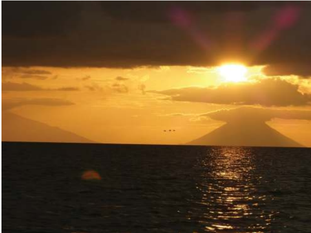
Figure 3. A view of Ometepe Island with its twin volcanoes illustrates the proximity of a major fault line to the canal route.

to 190 camera-trap days) and detected less than 50% of the known species for the region (Jordan and Urquhart 2013, Jordan 2015). The mitigation measures suggested by ERM are unlikely to be useful for rebuilding forests or preventing substantial biodiversity loss.