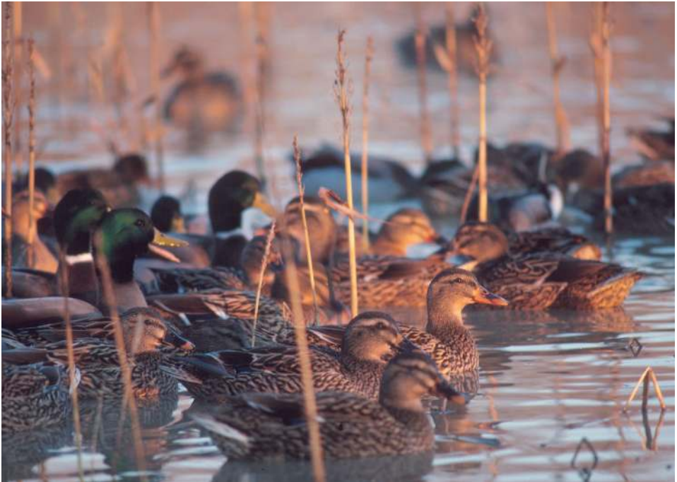
Photograph: Mallard benefitting from wetlands in Maryland, by Ron Nichols/USDA Natural Resources Conservation Service.