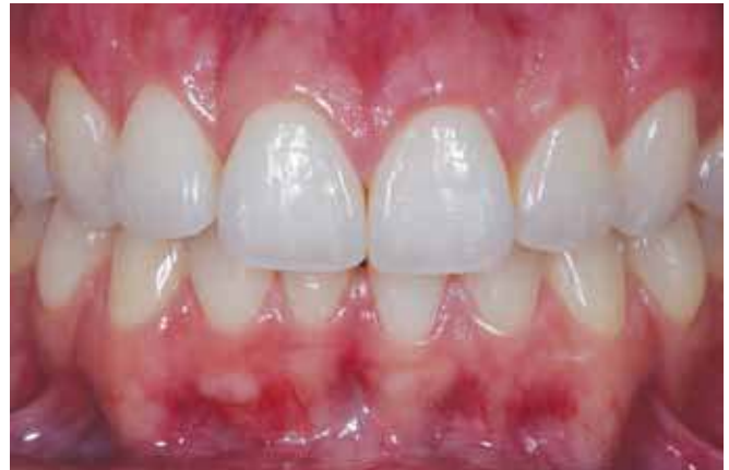
Fig. 5: Three years follow-up clinical aspect. The gummy smile is completely solved, good gingival health and form are achieved

More invasive techniques can be used to treat APE, such as orthognathic surgery and plastic surgery. 1,3,11 Invasive techniques for treating APE are considered in cases involving extraoral causes of a gummy smile, such as vertical maxillary excess and hypermobile/short upper lip. It is unlikely to expect that intraoral proceedings can promote a suitable result in the treatment of APE when the cause is related to high discrepancies among extraoral parameters. 1,11,13