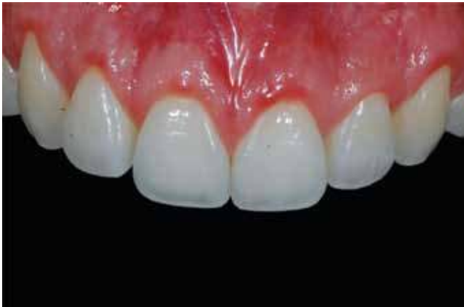
Fig. 4: After 90 days, on a follow-up visit, a harmonic appearance of gingival tissue