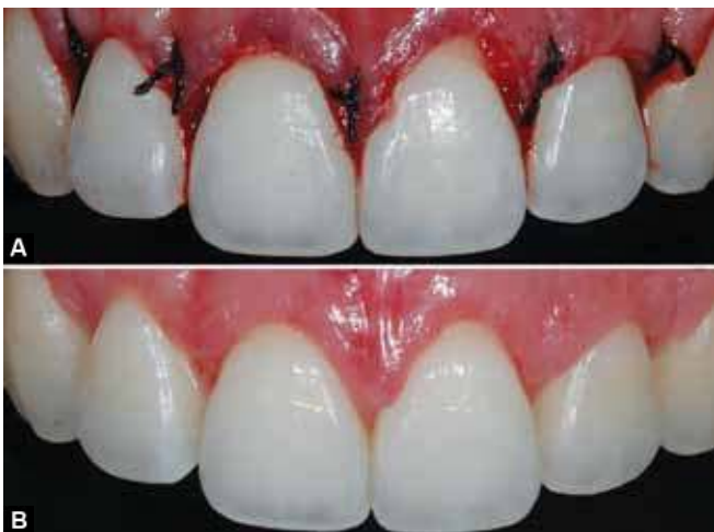
Figs 3A and B: (A) The final suture is a single suture connecting the surgical papilla to the anatomic papilla and (B) at time of suture removal (11 days), the harmony of mucogingival tissue is re-established

of 0.75 to 0.80. 4 The gingival margin of the maxillary lateral incisor is normally 1.0 mm below that of the adjacent maxillary central incisors/canines. An ideal smile design also depends on the dental midline of the maxillary and mandibular arch, besides the correct posterior tooth length. 1,16-18 Another factor to consider is to avoid the loss of interdental papilla, as it will detract