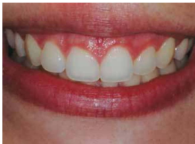
Fig. 1: Baseline clinical aspect

During an interview with the patient, it was noted that her posed smile did not display as much gingiva