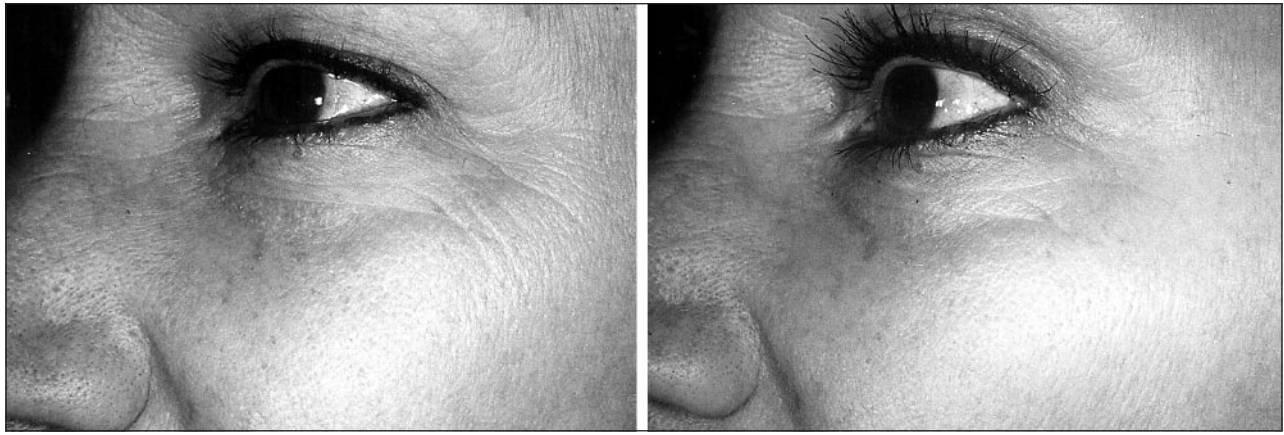
Figure 1. A 53-year-old patient with moderate wrinkling prior to nonablative treatment of rhytides (left) and 24 weeks posttreatment.