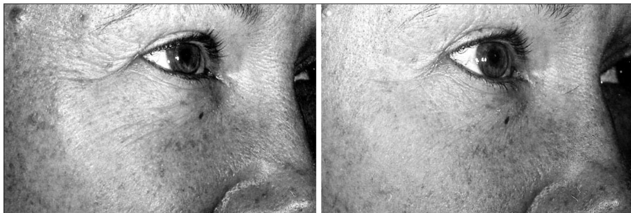
Figure 3. A 47-year-old patient with moderate wrinkling prior to nonablative treatment of rhytides (left) and 24 weeks posttreatment (right).

the epidermis is specifically protected would not be expected to affect surface texture and pigmentary changes that are also a considerable aspect of photoaging. Improved results might be obtained by combining nonablative laser treatment either with a pretreatment regimen that includes tretinoin, glycolic acids, and bleaching agents or superficial chemical peels that would promote epidermal improvement without significant morbidity.