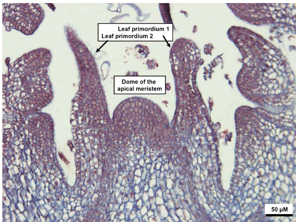
Figure 1 A typical shoot tip of potato ( Solanum tuberosum ) used for cryotherapy.

depends on efficient conservation and proper utilisation of plant genetic resources (Esquinas-Alcázar, 2005). It is estimated that up to 100 000 plants, that is more than one third of all plant species of the world, are threatened or face extinction in the wild (GSPC, 2002). Industrialisation, urbanisation and especially global warming will worsen this situation (Esquinas-Alcázar, 2005; Thuiller et al. , 2005; Lynch et al. , 2007). The International Treaty for Plant Genetic Resources for Food and Agriculture was made within the framework of the Food and Agriculture Organization of the United Nations and entered into force in 2004. The objectives are the conservation and sustainable utilisation of plant genetic resources for food and agriculture and the fair and equitable sharing of benefits arising out of their usage for sustainable agriculture and food security.