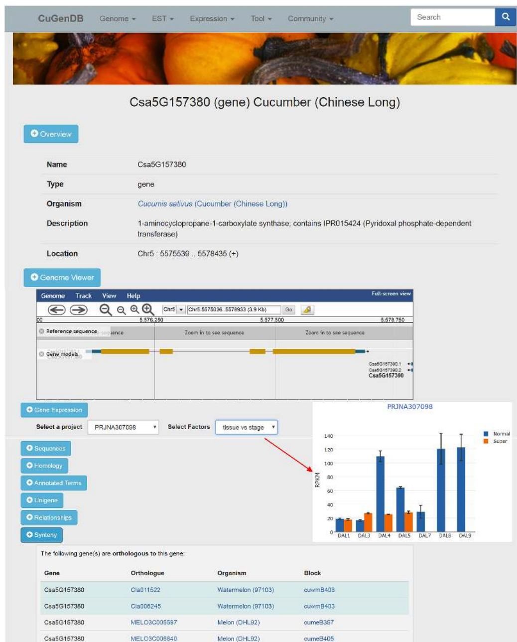
Figure 1. Gene feature page in CuGenDB. The page contains different sections with different content types. The inset histogram shows expression profiles of a specific gene under a selected project in the 'Gene Expression' section.

set, gene functional descriptions assigned by AHRD, GO terms assigned by Blast2GO, and enzyme commission (EC) numbers derived from the top hits in the UniProt database are integrated into a file in the PathoLogic format, which is used by PathwayTools for pathway prediction. A total of 320–430 biochemical pathways have been predicted from each genome or unigene set. A cucurbit biochemical pathway database (CucurbitCyc) has been implemented in CuGenDB using the PathwayTools web server (31). Users can search and browse the predicted pathways, as well as perform comparative and omics data analyses through the CucurbitCyc database.