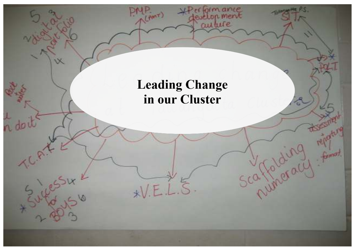
Figure 2: Leading Change. Cluster - Rural Region Victoria