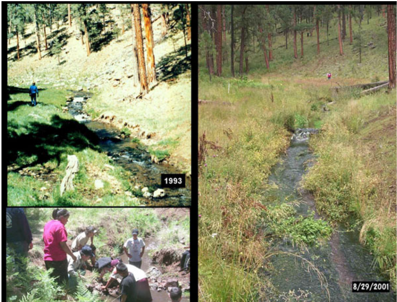
Fig. 3. Trampling by horses and elk had induced bank erosion and channel incision along Soldier Creek by 1993 (upper left). Three years of treatments, starting in 1998, including electric fencing, sedge transplants, and placement of rock-gravel riffle formations (lower left), stimulated dramatic recovery of channel stability and aquatic vegetation (right). Young tribal members have conducted restoration work at the site each year as part of the Watershed Program’s summer ecology camps.

The Tribe’s perspective on land management continues to inform restoration activities in ways that may run counter to restoration efforts in other parts of