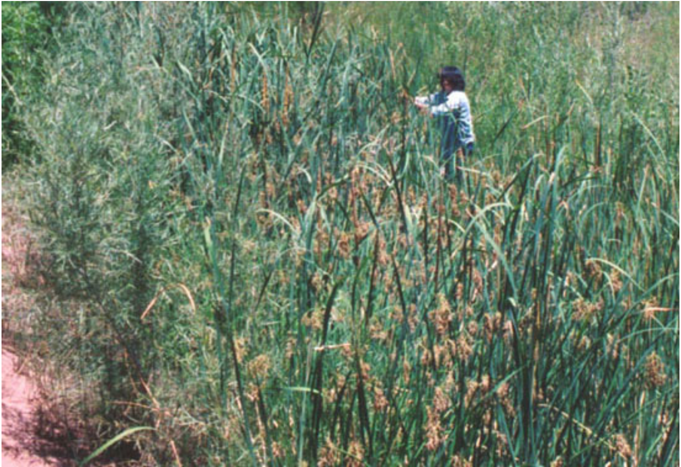
Fig. 6. Watershed Program Supervisor Benrita Mae Burnette collects pollen amidst a dense stand of common cattail ( Typha latifolia ) and soft-stem bulrush ( Schoenoplectus validus ) at the restoration site on East Cedar Creek. Because these plants are culturally significant, their abundance represents both the functional and symbolic recovery of the site.

The importance of reciprocal relationships requires that restoration activities emphasize learning about the land from elders and passing on that knowledge to the youth. Advisors believe that past deterioration likely stemmed from the failure to hand down important knowledge to younger generations. Government boarding schools that removed children from their homes and banned native languages fostered such breakdowns in intergenerational knowledge transfer (Turner et al. 2000). Consequently, an important facet of the Tribe's restoration efforts has been instituting youth ecology camps and collaborations with local schools where tribal member adults teach youths how to care for their lands. Reinforced with scholarships sponsored by the Land Restoration Fund, these efforts have encouraged many young tribal members to pursue higher education in environmental fields (Long