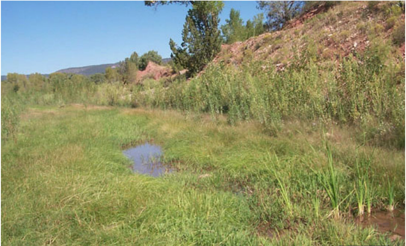
Fig. 2. A luxuriant carpet of herbaceous wetland plants render this reach of Carrizo Creek relatively “smooth,”—able to withstand large floods without experiencing erosion. A large wildfire had struck the watershed above this site a year before this photo was taken, yet the channel did not degrade and the wetland plants were able to quickly stitch the fresh sediments into streambanks.

When advisors have not supported a proposed intervention, they have recommended instead, “Let Mother Nature take care of herself.” This response reflects a conviction that the cause of deterioration was non-physical, that the proposed treatment would be inopportune, or that the perceived deterioration was beyond the proponent’s competency to treat. This attitude has been called “environmental therapeutic nihilism,” a term derived from skepticism toward medical interventions (Hargrove 1992). That such skepticism would occur in White Mountain Apache attitudes toward environmental matters is not surprising, as it also surfaces in attitudes toward health care. Decisions to seek medical care by hospital