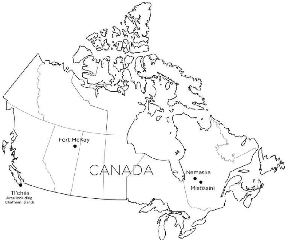
Figure 2. Map showing location of the three case examples from Canada of “Cultural Keystone Places.”

its original cover remaining (Lea 2006). Garry oak savannahs are part of a culturally maintained landscape, reflecting the ecological imprint of intensive Indigenous management practices, mainly through frequent low-intensity fires, over thousands of years, yielding an open landscape for hunting and increased production of camas ( Camassia quamash [Pursh] Greene, C. leichtlinii [Baker] S.Watson) and other edible geophytes (Anderson 2005; Beckwith 2004; Turner 1999). Tl'chés's Garry oak ecosystem is habitat for many native species, including red-listed California buttercup ( Ranunculus californicus Benthams), Macoun's meadow-foam ( Limnanthes macounii Trelease) and the endangered sharp-tailed snake ( Contia tenuis Baird & Girard), among others (COSEWIC 2009). Camas, a cultural keystone species for Coast Salish peoples of Vancouver Island (see Garibaldi and Turner 2004), survives on ancient, cultivated shallow soils in parts of Tl'chés , and has been the object of restoration studies recently (Beckwith 2004; Gomes 2012; Gomes 2013; Higgs 2003). Tl'chés encompasses numerous culturally significant areas such as heritage orchards, shell middens, culturally modified trees, and sacred sites; however, the archipelago's biocultural diversity is threatened by land use conflicts and invasive species (Gomes 2012).