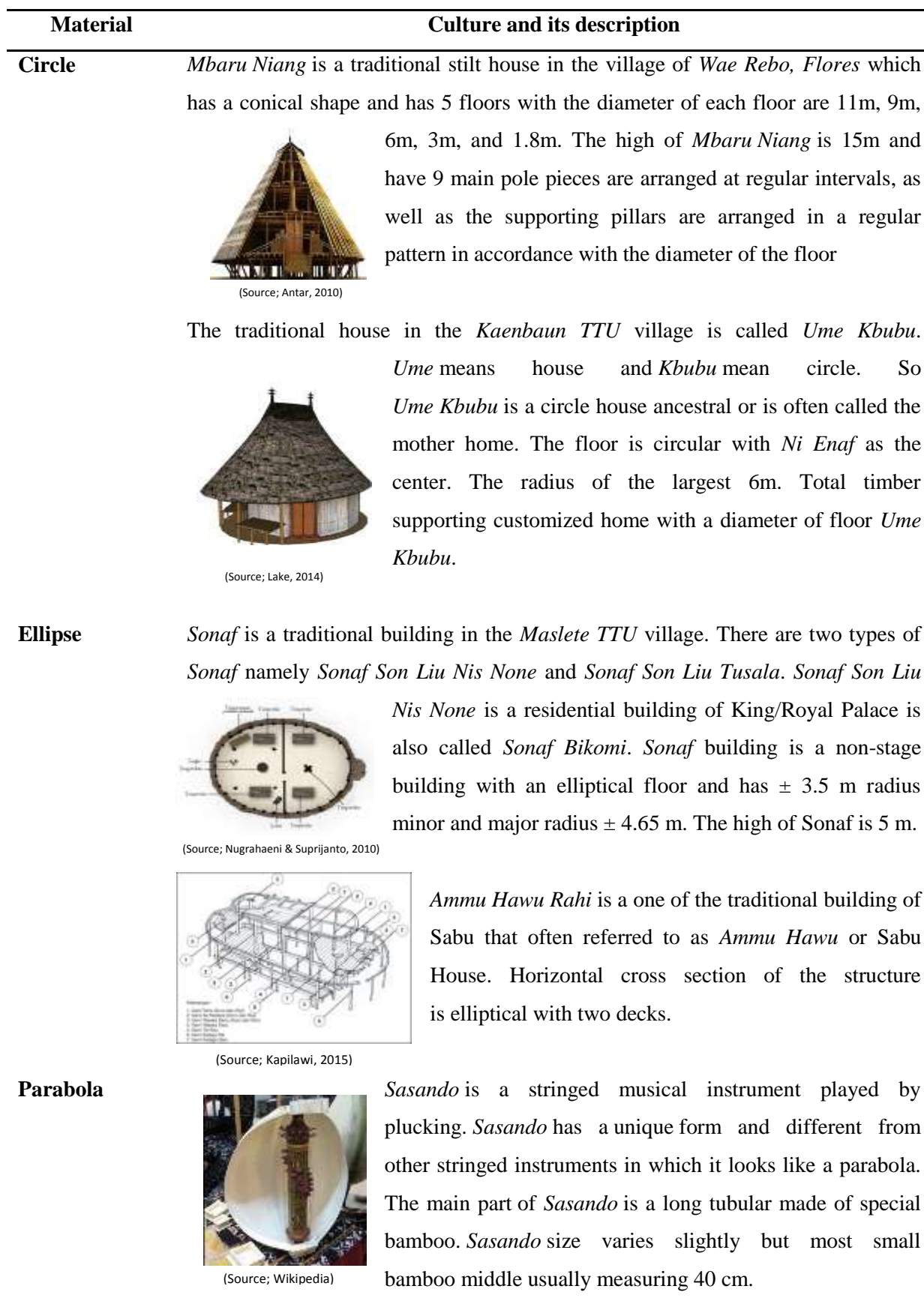
Table 1. Mathematics aspects and culture