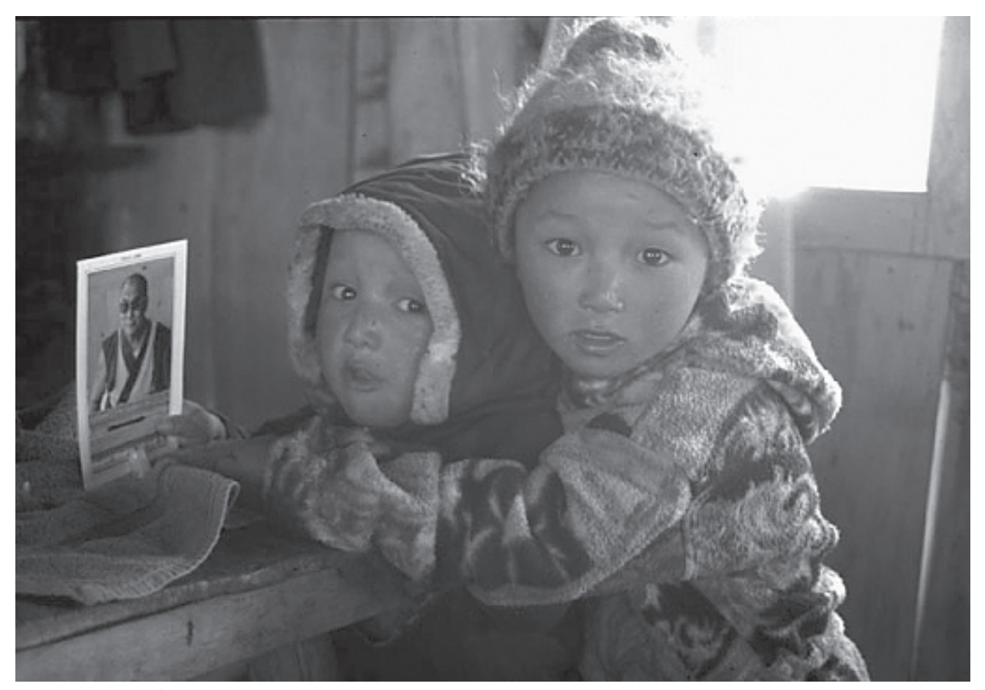
Children with photo of Dalai Lama

The first Americans to work for the survival of Tibetan culture were originally attracted to Buddhist philosophy. Through contact with Buddhist forms they came to work for Tibetan survival. These people remain the backbone for western support