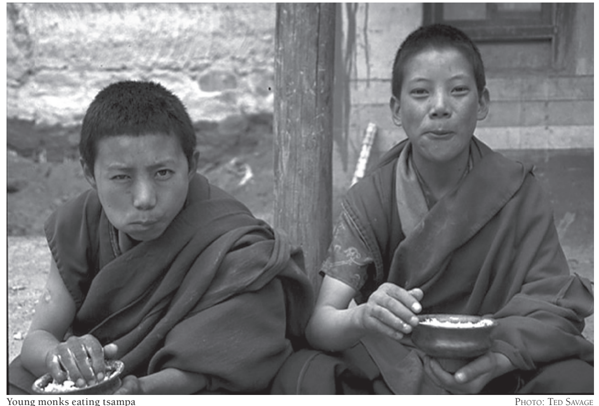
Young monks eating tsampa

his essay explores the ways that Western economic support for Tibetan exile monasteries in South Asia stimulates (1) the exodus of young males from the Buddhist highlands of Nepal, and (2) the homogenization of diverse religious practices in those same areas. I argue that the attempt to "preserve" Tibetan culture by supporting monks and monasteries has unanticipated consequences that reverberate beyond the point of articulation between patrons and priests. The resultant processes of culture change are veiled by a persistent assumption about the nature of Tibetan societies, namely, that Tibetan culture finds its expression first and foremost in monastic Buddhism, and that anything that does not fit the normative mold represents degeneration from a pristine cultural template (see Ramble 1993).