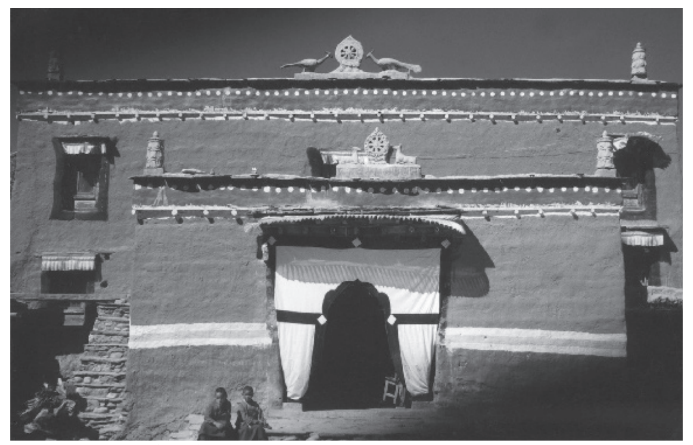
Chyodi Gompa in Lo Manthang (Mustang) Nepal

A new monastery is now nearing completion in Nubri. Funding is provided by a well-endowed institution in India, which in turn is patronized by scores of devotees from the West. The point-men for construction are three mkhan-bu (disciples of the main monastery's abbot), two of whom are thirty year-old monks who were born in Nubri and sent to South India while youths. When the monastery opens in the summer of 2006 it is expected to be populated by fifty or so monks who are presently undergoing training in South India. Their return will partially offset the out-migration stimulated by monastic recruitment. In addition, their ascent of the local religious hierarchy will inevitably transform ritual practices and social structures that have evolved in situ over the centuries.