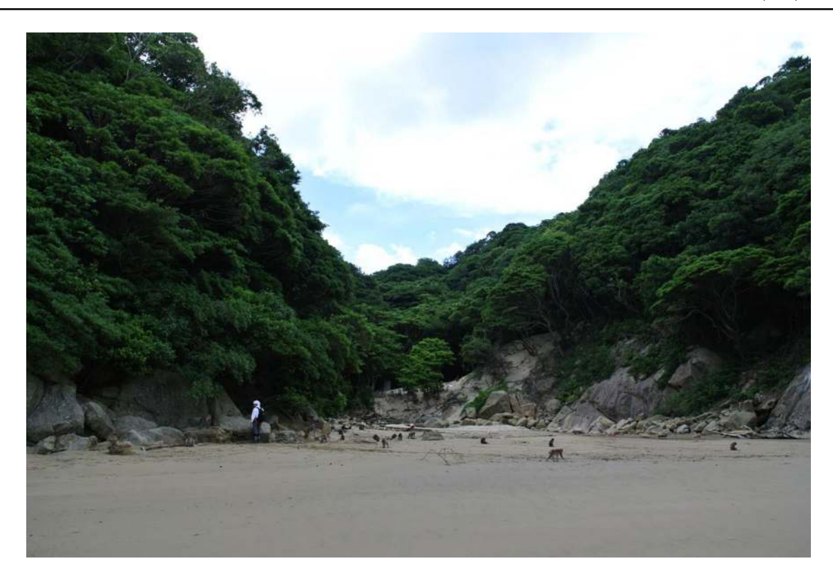
Fig. 1 View from shoreline of the beach and forest on Koshima island