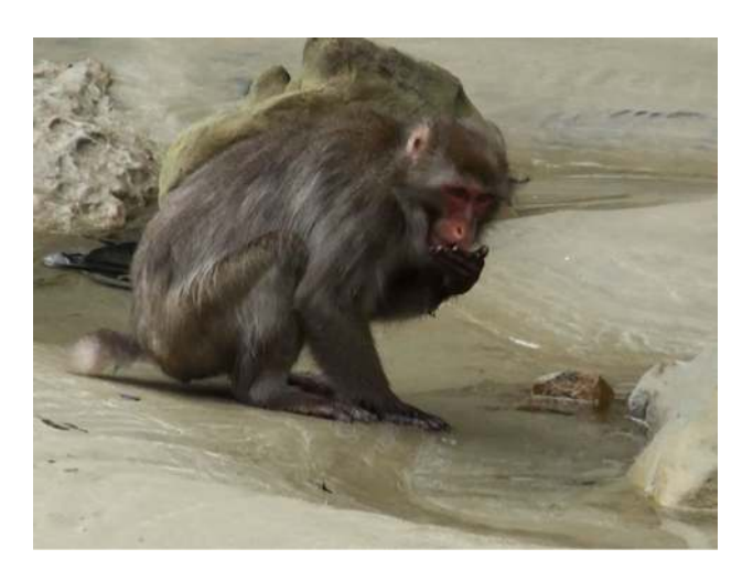
Fig. 4 Japanese macaque washes wheat on Koshima beach

'Wheat washing' (WW, also called 'sluicing' or 'placer mining;' Hirata et al. 2001) entails wheat grains being scattered/dropped/rinsed in water. Initially when wheat grains were scattered on the beach, the monkeys painstakingly picked up the individual grains one-by-one with thumb and forefinger opposition. The first behavioral variant emerged in 1956, when Imo picked up a mixture of wheat grains and sand from the beach, carried this mixture to the water's edge,