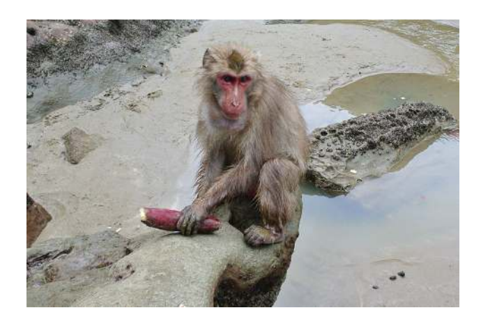
Fig. 3 Sweet potato washing on the beach at Koshima

geo-helminthic infection (Sarabian and Macintosh 2015). Emergence of new hygienic variants (e.g., from simply dipping and brushing to immersing and rolling) may represent (unintentional but potentially useful) cumulative progress in reducing the risk of acquisition of harmful parasites.