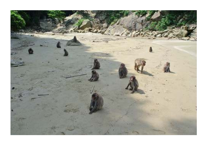
Fig. 2 Japanese macaques on the beach at Koshima

were given mainly two staples: unwashed sweet potatoes were dumped and unhusked wheat grains were scattered on the sand. (Wild monkeys are well known to be crop-raiders that "grub out" sweet potatoes and pilfer rice from farmers' fields; Kawamura 1972.) Initially, the macaques used their hands or body hair to brush away sand from the potatoes (Watanabe 1994). However, in 1953, a 1.5-year-old juvenile female named Imo started 'sweet potato washing' (SPW) ('dip and brush' in Table 1), and the behavior quickly spread to other individuals in the group (Kawai 1965). Four phases