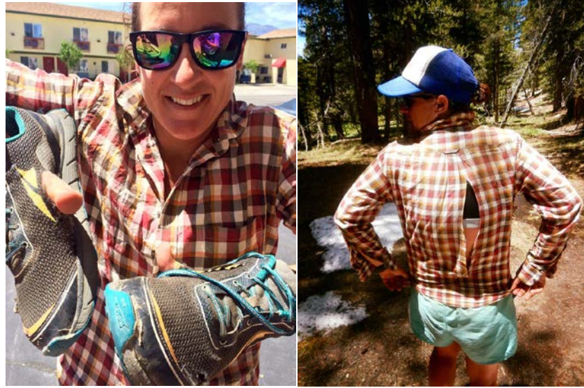
Figure 6: Women in the outdoors with sweat, cuts and grazes and messy hair

We also encourage changing the cultural narratives of women in the outdoors through online support groups. Social media provides a way to develop communities that seek to empower and support females to pursue outdoor pursuits. For example sites such as SisuGirls have an online global community (through Facebook and Instagram) that is passionate about developing sisu (a Finnish word for bravery, determination and resilience) in girls through sport and adventure. The pictures posted on their various social media platforms are shared by women and girls who believe their images capture sisu and demonstrate their strength and adventurous qualities. The sole purpose of such communities is to provide a non-judgmental space for the celebration of the female outdoors. Also, Women in Wilderness Leadership is a group on Facebook that supports the development of female leaders in the outdoor industry and posts cutting edge research and achievements by women in the outdoors, more so than outdoor images. These groups may help balance the pressures of commodification and aestheticization that women in the outdoors face when engaging with social media.