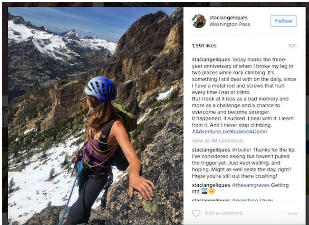
Figure 5: Feed from Staciangeliques post