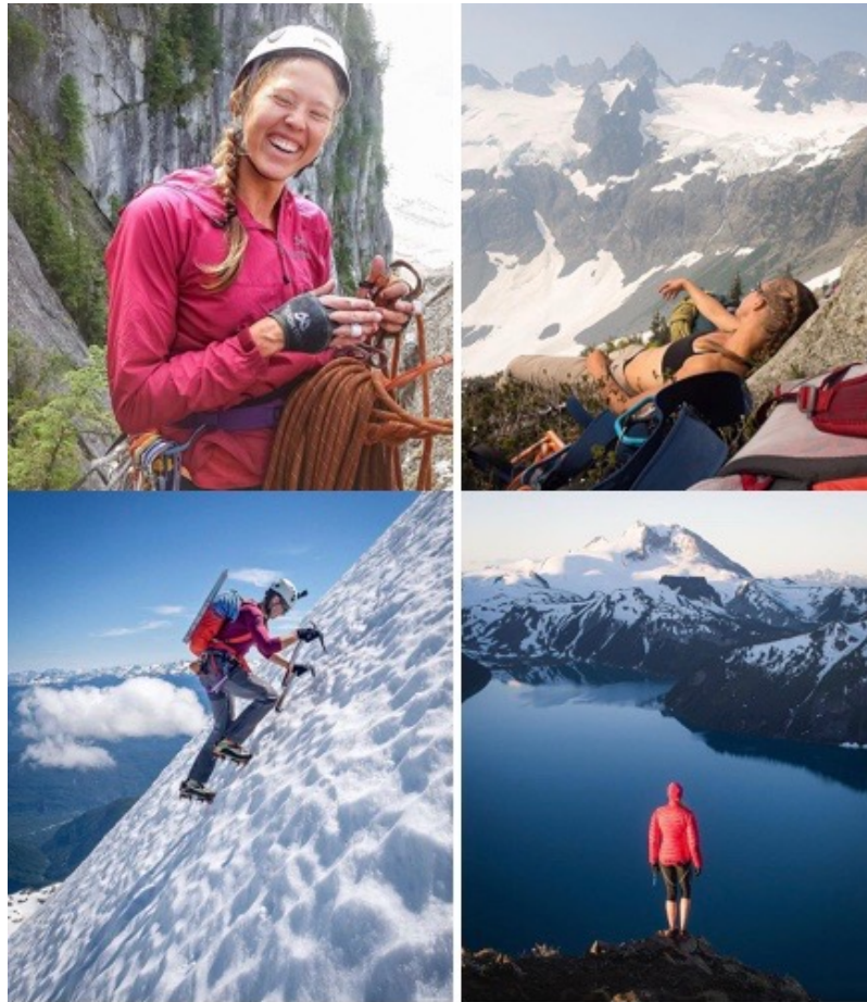
Figure 1 Collage of Photos from outdoor women on Instagram