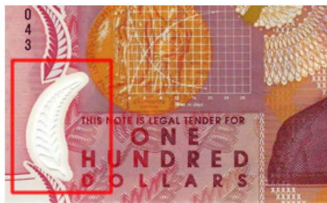
Fig.1. See through window on the New Zealand banknotes in the shape of a fern leaf, also on the corresponding side a see through window stating the denomination value having a unique raised tactile quality.

To the naked eye, the surface of BOPP appears and feels smooth to the touch. Under microscopic examination, the surface consists of a random scatter craters. Advocates for the use of BOPP security substrate claim a robustness surpassing the lifetime of traditional paper substrate, and security features not yet feasible with paper. In particular, the see through window feature Figure 1 which turns black when scanned or photocopied.