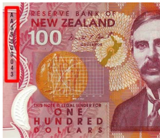
Fig. 3. A unique identifier, the serial number is usually found repeated vertically on the left hand side and horizontally on the right hand side of both the front and back.

A serial number shown in Figure 3 uniquely identifies an individual banknote, and is stored in a database. Repetition of the same serial number will never occur on authentic currency, many counterfeit attempts have been detected by observing repeating serial numbers. The exact method for creating serial numbers differs from one country to the next.