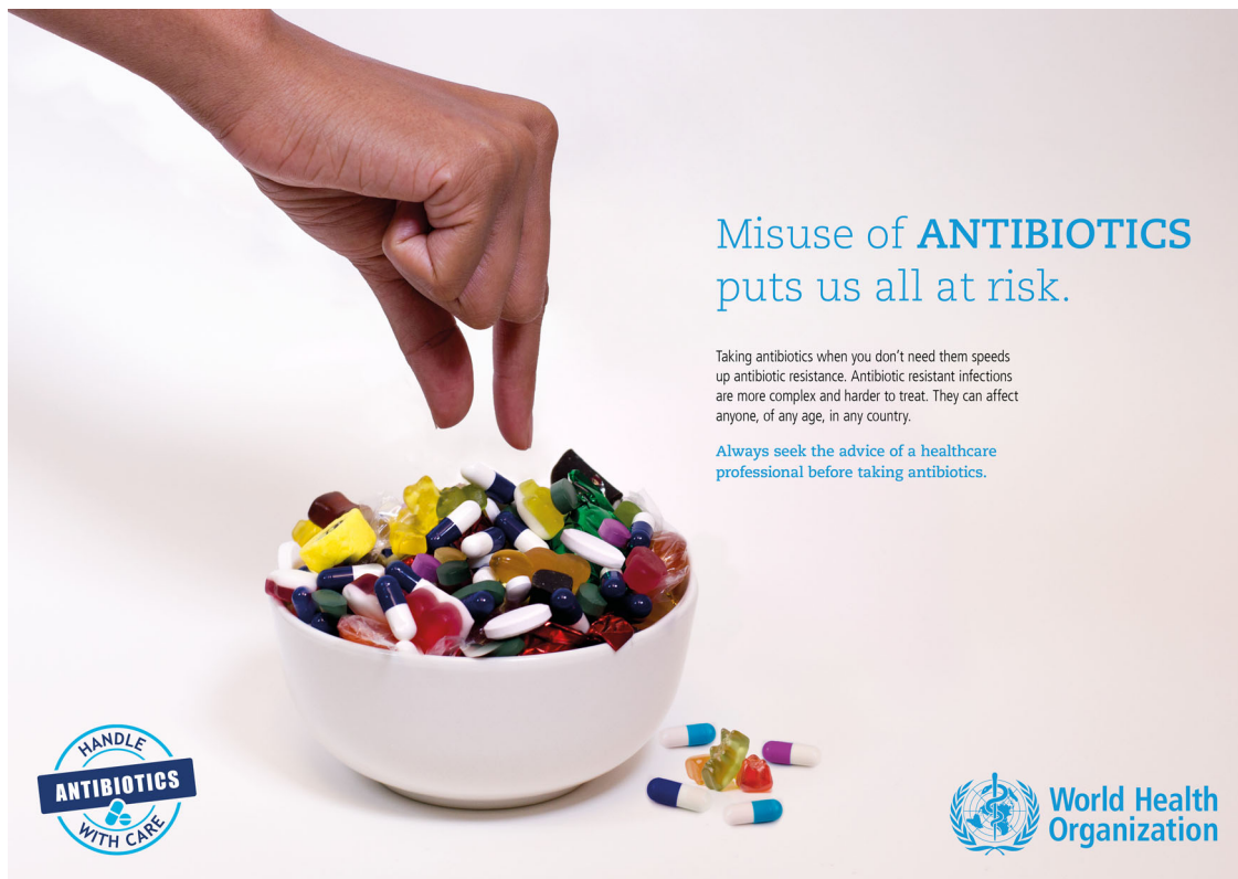
Fig. 2 WHO Poster for World Antibiotic Awareness Week (2017). This figure is covered by the Creative Commons Attribution 4.0 International License. Reproduced with permission of World Health Organisation from 'World Antibiotic Awareness Week 13–19 November 2017' https://www.who.int/campaigns/world-antibiotic-awareness-week/2017/posters/en/ Copyright © WHO (2017), all rights reserved