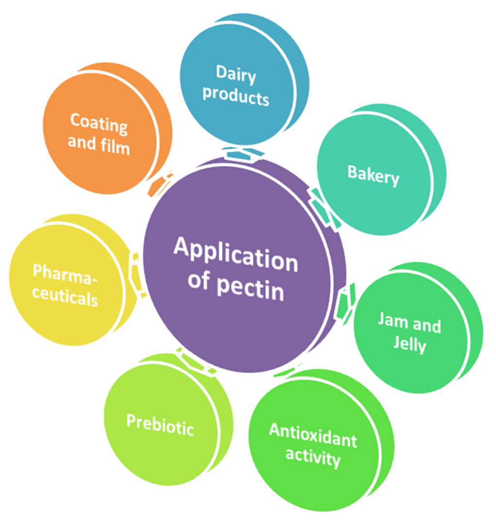
Figure 2. Multifunctional applications of pectin.