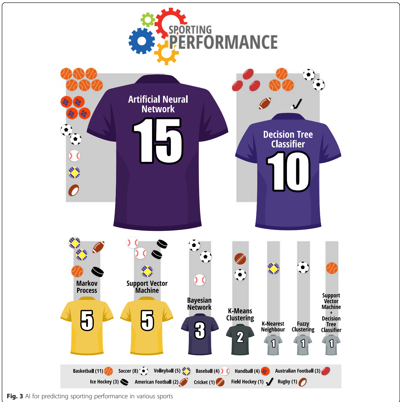
Fig. 3 AI for predicting sporting performance in various sports

National Collegiate Athletic Association (NCAA) Division 1 (i.e., 1 in 5,200 vs. 1 in 53,703 athletes per year) [84, 85]. For injury risk prediction, the most frequently used AI technique or method ( n = 2 studies) applied in collegiate and professional basketball players was artificial neural network [64, 66].