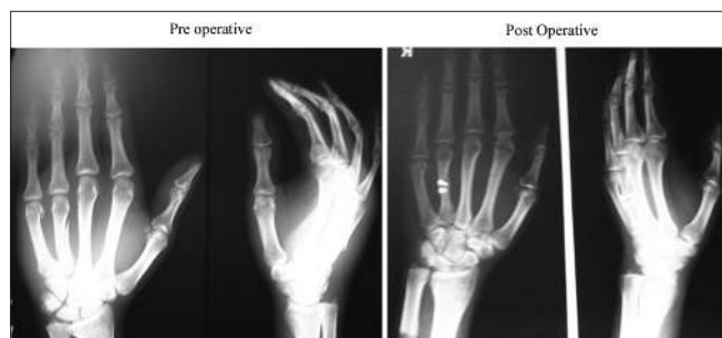
Figure 5: Spiral fracture of the shaft of the 4 th metacarpal fixed with ORIF using two screws

and badly comminuted closed intra-articular fracture dislocations. Ideally a digit with skeletal injury should not be immobilised for more than three-four weeks to have an acceptable functional outcome. As the need for soft tissue replacement [23] is high in compound fracture of the hand, the external fixation used for skeletal stabilisation should not preclude local, regional or distant flap coverage. Dynamic spanning fixator which can achieve and maintain reduction and yet allow mobilisation makes it an ideal choice for pilon fracture of the base of the phalanges with or without subluxation or dislocation.