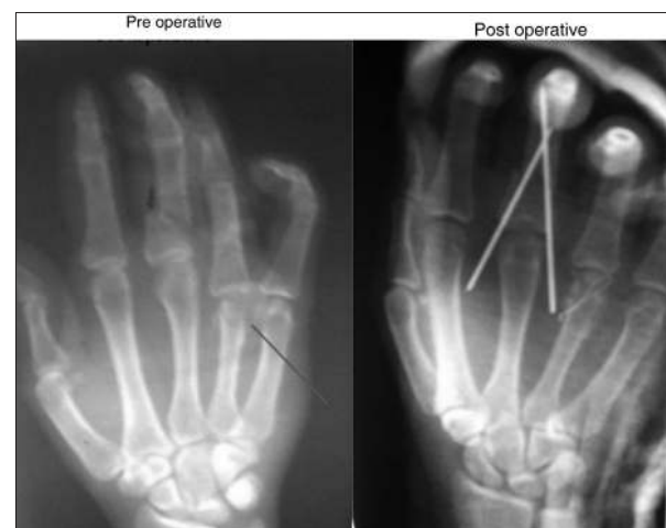
Figure 7: Open two part fracture of the 4th metacarpal head and fracture proximal phalanx of the middle finger fixed with SS wire and criss cross K wires respectively

Epibasal fracture with angulation more than 20° needs closed reduction and thumb spica application.