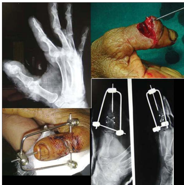
Figure 6: Open fracture of the neck of the proximal phalanx of right thumb fixed with bone tie and external fixator following repair of EPL tendon

Metacarpal neck fractures also called Boxers fracture are generally caused due to direct impact of the clenched fist on a solid object. Because of the compensatory movement of the basal joints, the acceptable dorsal angulations of neck fractures are 40, 30, 20 and 10° for the 5 th , 4 th , 3 rd and 2 nd respectively. Uncorrected dorsal angulation will lead to unsightly dorsal deformity, prominent metacarpal head on the palmar side, pseudo clawing and diminished flexor force at the MP joint. [24] Majority of the closed uncomplicated fracture metacarpal neck can be managed conservatively by obtaining acceptable reduction using Jahss manoeuvre, [25] where the small distal fragment is controlled and manipulated by flexing the MP joint, along with dorsally directed corrective force to obtain reduction. The reduction thus obtained can be maintained with dorsal slab or a splint immobilizing the wrist in extension and MP in flexion of 60 to 70°. The whole manoeuvre could be done under local block. If the displaced fracture is reducible