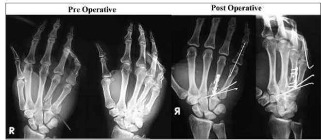
Figure 1: X-ray showing multiple fractures involving the shaft of the 4th metacarpal, basal intra articular fracture of the 5th metacarpal and open comminuted fracture of the proximal phalanx of the right little finger. ORIF is indicated in multiple fractures involving the hand. Note that the comminuted fracture of the shaft of the 4th metacarpal has been fixed with a bone tie and a neutralisation plate

Open reduction in closed fracture metacarpal is generally