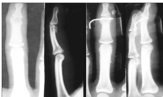
Figure 9: Closed unstable unicondylar fractures of the head of the middle phalanx fixed with a closed transverse K wire following acceptable reduction