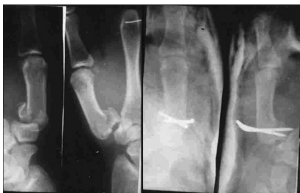
Figure 8: Closed Bennet's fracture fixed with CRIF using two K wires across the fracture site

Oblique fractures short or long like the transverse fractures can be stabilised by conservative nail traction or percutaneous fixation. Unstable long oblique fractures of shaft of the phalanges often need ORIF with K wire (composite or supplementary wiring) or interfragmentary screw fixation (mini or micro plates when used are preferably