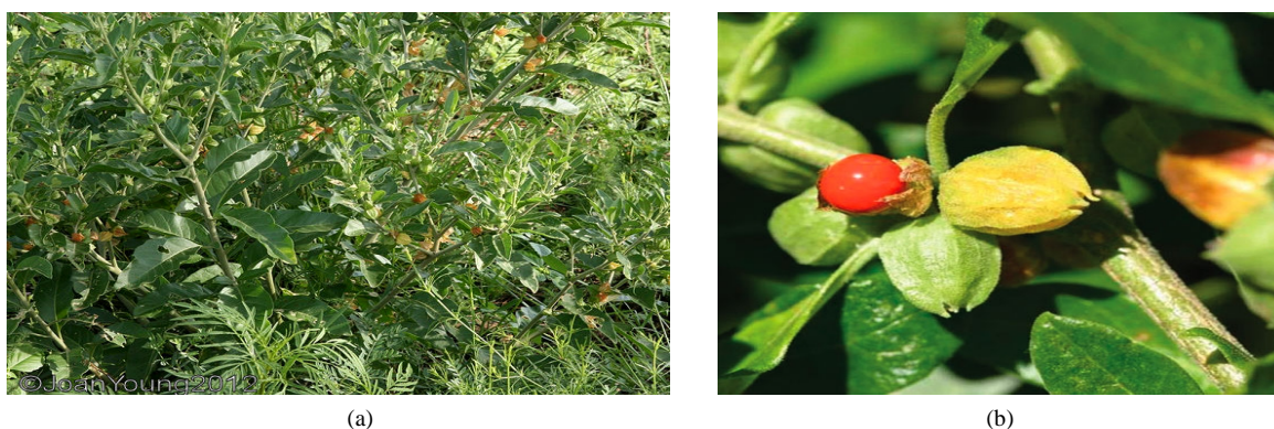
Figure 2. (a) W. somnifera plant; (b) W. somnifera fruits.

China and Bangladesh. It is distributed in the base of hills in broad-leaved and Pinus roxburghii forests [6].