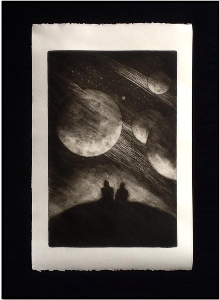
Figure 7. Untitled , Aluminum Plate Etching, 15" x 22", 1999.