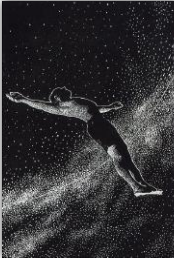
Figure 3. The Fourth Dimension , Woodcut, 32” x 44”, 2000.

titled it, when I read Einstein’s theory with that same name, it fit perfectly. As for the flowing elliptical star field, the “current”, the Arnheim quote, “The line that describes the beautiful is elliptical” 11 concurs with the concise statement of Johannes Kepler (1571-1630), “I have the answer, the orbit of the planet is a perfect ellipse.” 12