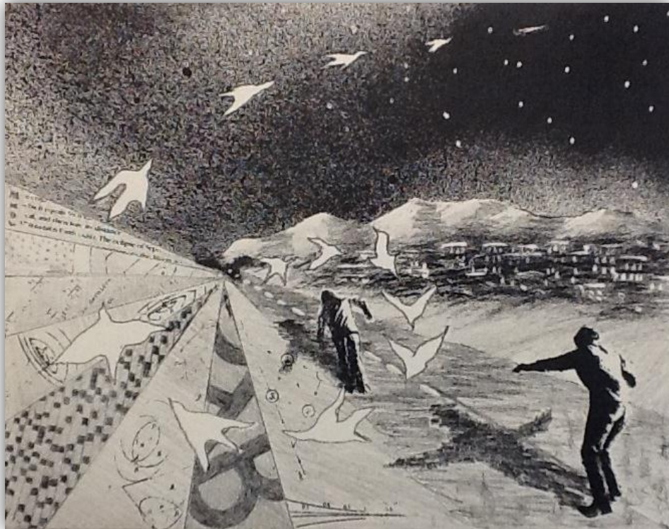
Figure 4. A Certain Direction , Stone Lithograph, 14 1/8" x 11 1/4", 1997.

As the person moves toward the universe, prisms of human knowledge kaleidoscope around him, and fall away. Wings appear in the human shadows as the path of earth moves quickly toward spirals of the galaxy and a universal sky.