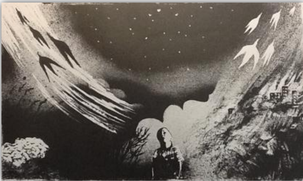
Figure 1. The Dichotomy , Stone Lithograph, 22 1/2" x 15", 1998.

A wind sweeping to ground level is perceived as coming from an upper atmosphere. In a way, it can be disruptive, but it can also bring freshness and change to the perceived reality for even a moment. Exhilaration or enlivening are sometimes experienced in a rushing wind, as though something greater than what a person's attention had been focused on sweeps through. Awareness of a greater force of nature and its associated freshness, force, or powerful potential can awaken a person. Each of us at some point in life has entered a doorway, and said to someone there, "Wow, it's blowing!", or "It's really snowing!" (especially in Montana). This isn't a boring moment. Awareness at that moment isn't filled with rehearsal, old images, work, or internal dialogue. There is a disruption, a break. In this subtle disruption, there is awareness of both the forces of nature and of our humanity. I think of it as an open moment. The image Dichotomy refers to such a break. This break, or subtle interruption, can be a threshold to