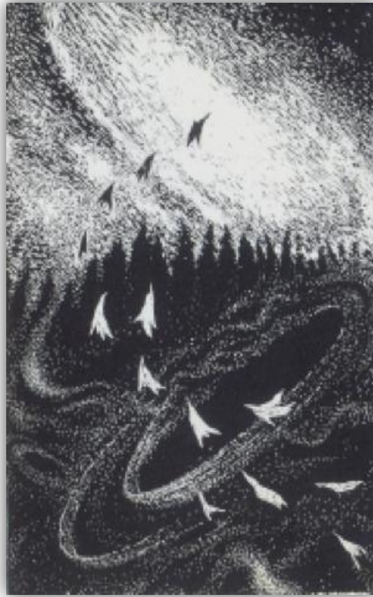
Figure 6. The Lucky Number , Woodcut, 32” x 44”, 2000.

The woodcut title, The Lucky Number , refers to the thirteen birds in flight. In discussion of the Great Seal of the United States, Joseph Campbell describes symbolism of the number thirteen. 25 The date at the bottom of the pyramid represents an occurrence in time, and the top, eternity. The 12 courses (levels) define the limits of the physical world. “The number 13, or eye at the top; eternity, and accordingly...represents a creative transcendence of the boundary: not death...but an achieved life beyond death”... signified by the model of the last supper where the 13 th person among them in the field of time was of eternity, beyond death. In this image, the phrase “creative transcendence of the boundary” describes the concept of this image, in which