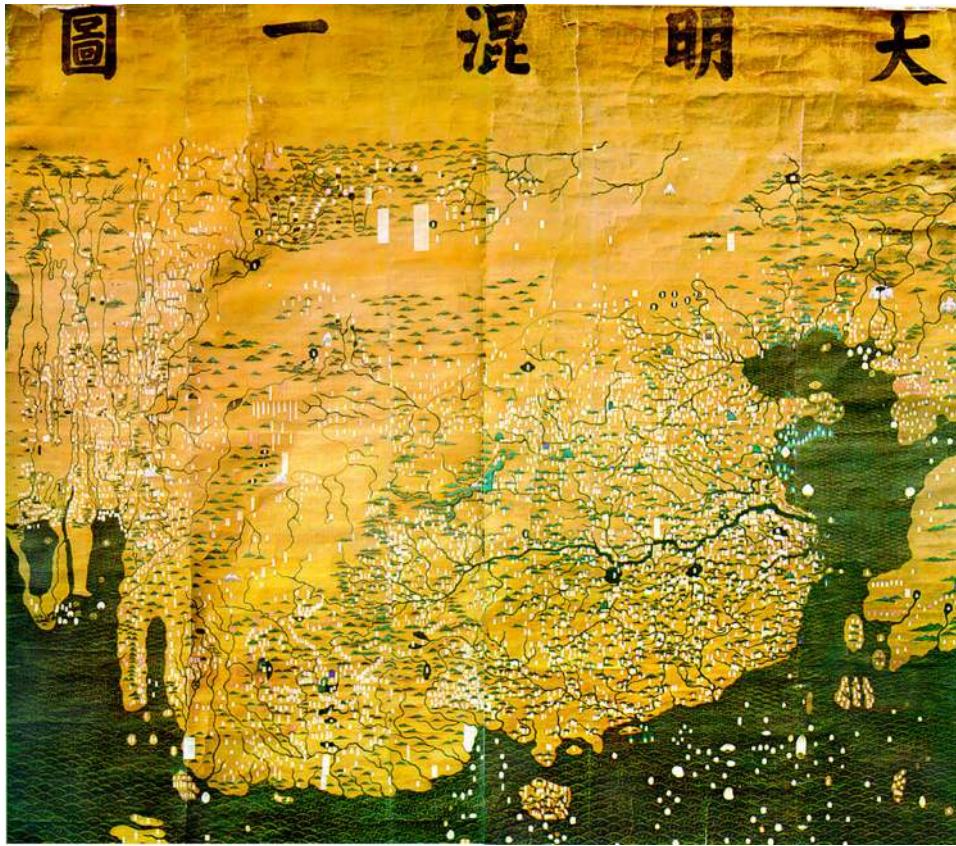
Figure 2. Surrounding landmasses are distorted to fit around China in 'Da Ming Hun Yi Tu' ('Amalgamated Map of the Great Ming Empire'). The map is 386×456 cm in size. https://upload.wikimedia.org/wikipedia/commons/c/cd/Da-ming-hun-yi-tu.jpg (accessed 19th of February 2017). Public Domain.