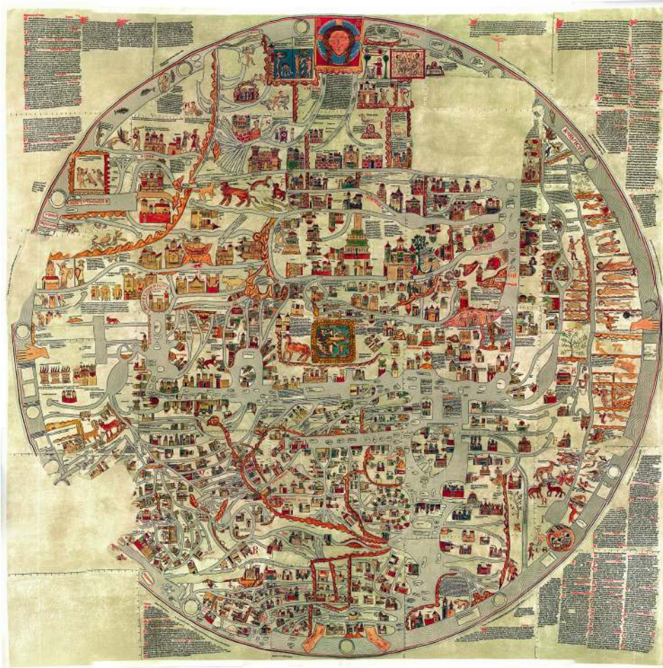
Figure 1. This map is probably from the late 13th century, perhaps created by nuns in a convent of Ebstorf in Lower Saxony. This 'T and O' arrangement, with Jerusalem at the center, was common in medieval world maps. The Ebstorf Map was the largest known European medieval map at about 3.6 meters squared (painted on 30 goatskins sewn together). The original was destroyed in Allied bombings of Hanover, Germany, in 1943. (Barber 2005, 58; Pischke 2014). https://en.wikipedia.org/wiki/Ebstorf_Map (accessed 19th of February 2017). Public Domain.

'navel of the moon', from Nahuatl, the Aztec (or Mexica) language (Anders et al. , 2001–2018). In their violent conquering lust, the Spanish assimilated and promulgated this cartographic and architectural vision as the Zócalo , which today remains the centre ('el centro') of Mexico City.