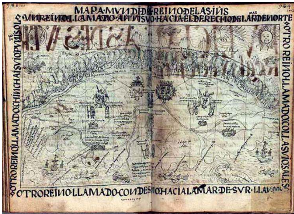
Figure 4. In sixteenth-century Peru, Felipe Guaman Poma de Ayala resisted the Spanish colonial power structure by depicting four world navels in his 'Mapa mundi de[l] reino de las In[d]ias' ('World Map of the Kingdom of the Indies') (Royal Danish Library, GKS 2232 4º: Guaman Poma, El primer nueva corónica y buen gobierno , 1615/1616)

written in a blend of Quechua and Spanish. The chronicle makes deep and pained observations regarding sixteenth-century colonial Peru from the perspective of 'indigenous Andean resistance and consciousness' (Adorno, 2011: 77). 2 The volume includes a prophetic cosmological vision of the past and future of 'las Indias' and the globe, which explicitly includes four world navels (Wachtel, 1973; Adorno, 2000). Guaman Poma's chronicle, re-rooting multiple world navels, remains the longest and most important indigenous critique of European imperialism in written form. 3