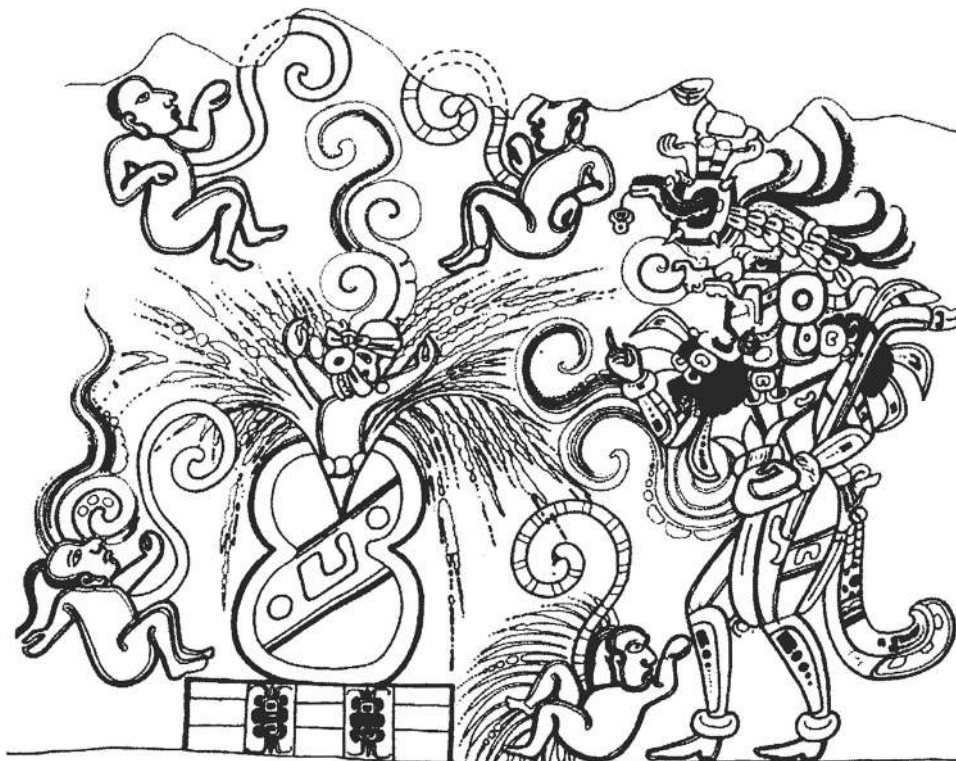
Figure 3. The arrangement of five infants in this mythological Gourd Birth scene suggests a world centre and four directions. It appears on the North Wall of the Mayan Pyramid of 'Las Pinturas' in Guatemala (Saturno, Taube, and Stuart, with renderings by Hurst, 2005: Figure 9, p.13. Used with permission.).