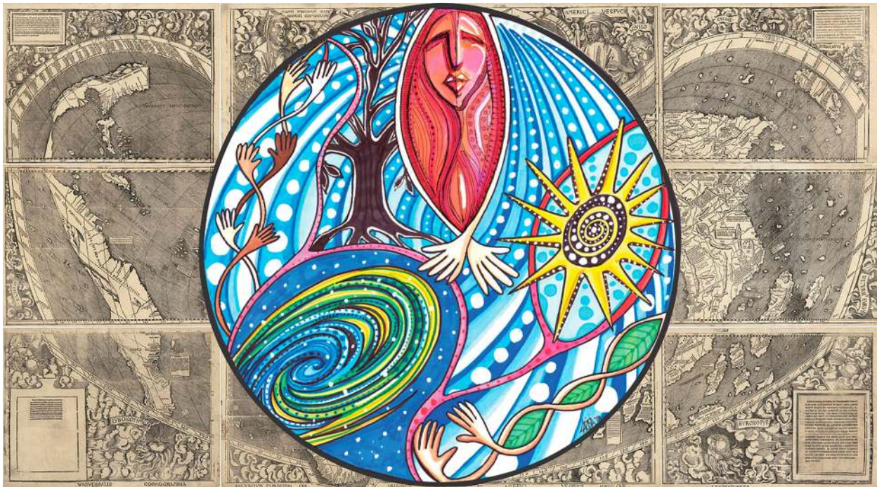
Figure 6. ‘Caught in the Legend’ by artist Larisa De Palma (commissioned by Rasmus Grønfeldt Winther) expresses the author’s hope that we can counter dominant views such as the colonialist 1507 Waldseemüller Map. One way to decentre our perspective from reified world navels (such as the Sun, the genetic code) is by considering three other tropes or themes of centring: the tree of life (here represented in black) is a recurring theme of rooting and the sacred across many cultures; the vagina or vulva (here represented at the top, with an emergent face) has long been considered a life-giving centre, as in the Las Pinturas depiction (Figure 3), and as comparative mythology shows (e.g. Hindu and Chinese; Blackledge, 2004; Winther, 2020); third, the ocean (the variegated background) is another common symbol of centredness and origins, especially in cultures deeply connected with the oceans and seas. Through pluralistic decentring, we achieve a more balanced awareness of other aspects of our existence (the far galaxies, the multiplicity of human forms and cultures). As argued in Winther (2020), science also guides us toward a more integrative, holistic vision when it adopts pluralistic views and mappings of space, brains, bodies and genes.

Excavating and integrating world-navel maps is not an idle pursuit. It could lead to a more hopeful future, in science and perhaps in politics as well. In science, we can combine distinct theories or models, lay bare their respective domains of application and explanatory and predictive tools, and even hybridize them. A growing repository of centralized world-navel maps could be a most useful exercise for critical diplomatic, pedagogical and museological reflection. In any event, the universe is an interesting and variegated place, deserving of our most interesting and variegated representations.