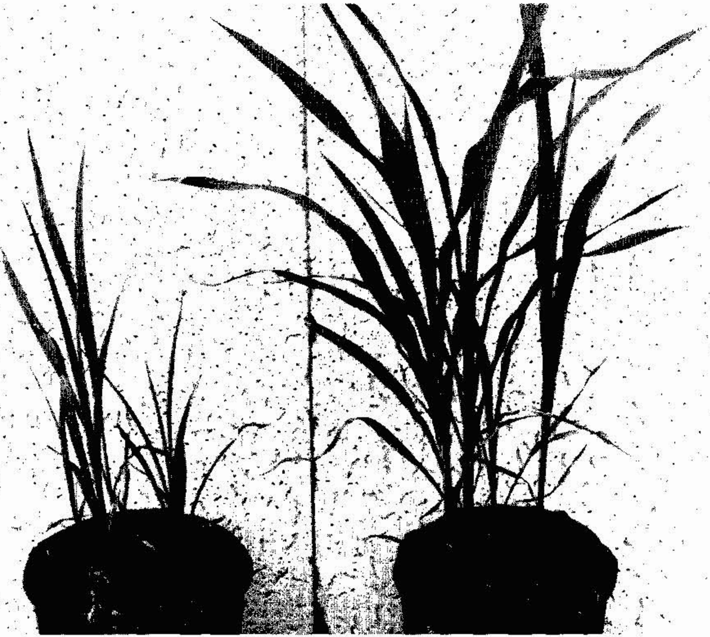
Fig. 3. Sorghum halepense plants after 60 days of growth on a soil mixture consisting of the surface 5 cm of a sand colonized by a heavy growth of cyanobacteria and Collema tenax (R) and the same depth horizon from a nearby site kept free of such growth by foot traffic (L). See Table 3 for characteristics of the two soils.

in those soils that the species would probably never have flowered and set seed on that substrate. When Sorghum was grown on a soil enriched by inclusion of the cyanobacterial- Collema inoculum, growth was much greater even though only N and Zn occurred in significantly greater concentrations in the tissue (i.e., all other essential elements occurred in higher concentration in plants grown on cryptobiota-free soil). These results suggest that even though cyanobacterial-rich crusts sometimes enhance uptake of several essential elements, plant growth (at least Sorghum growth) was limited by N (and perhaps Zn) only on the soil considered.