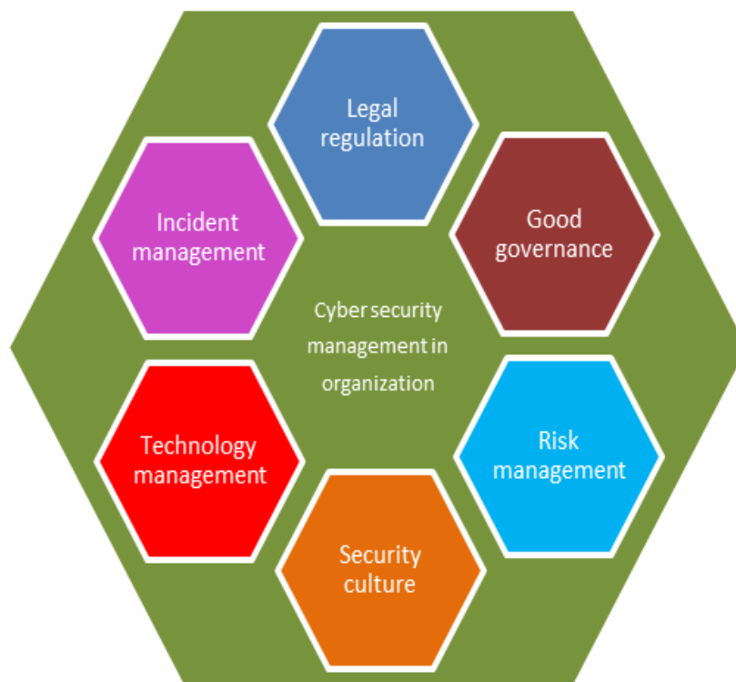
Fig. 2. Cyber security management model

Further on we will provide the cyber security management module which can be used to ensure security to any critical infrastructure as well as to improve the cyber security of any business company or government organization. However, we will not concentrate on usage of concrete technology equipment or information security management processes that are used for making critical infrastructure safer, but will provide core information about the proposed model. The whole model is presented in Fig. 2.