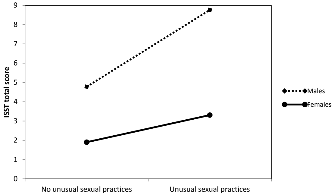
Figure 1. Gender moderating the association between unusual sexual practices and ISST score.