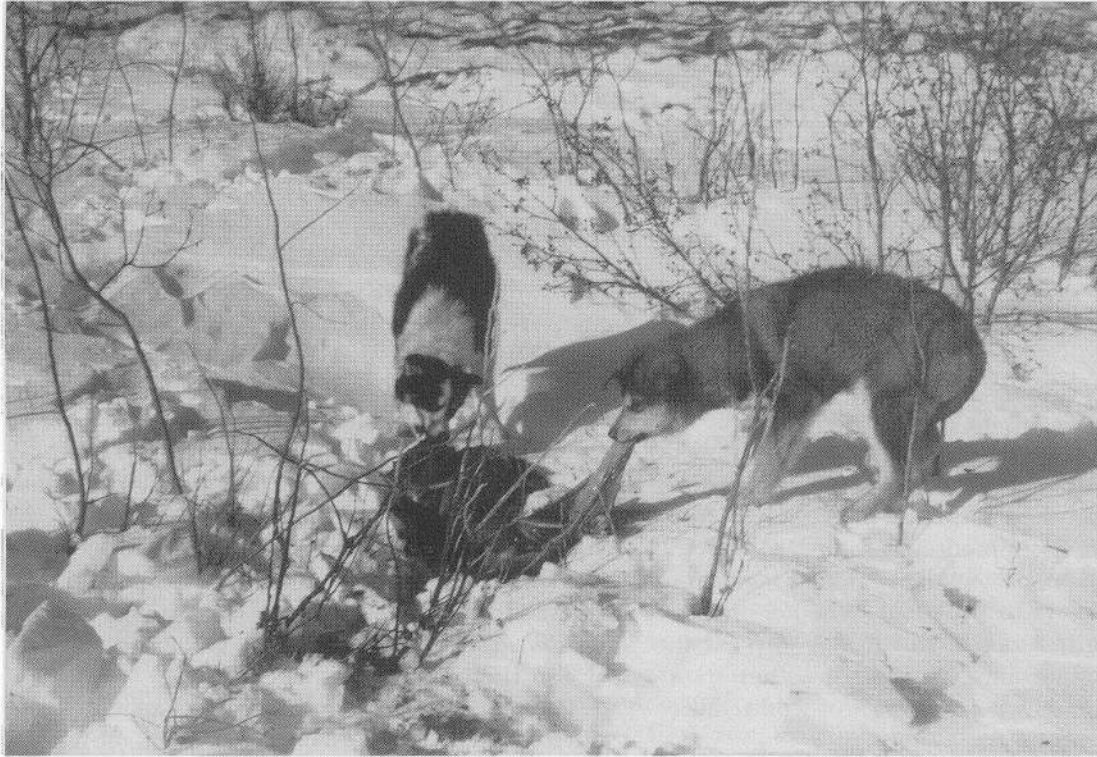
Fig. 4. Young dogs consuming the discarded viscera of a wild reindeer.

(C. Hanns, personal communication). There is no indication that echinococcosis occurs there at present; the village, now with modern facilities, has a population of approximately 300 people.