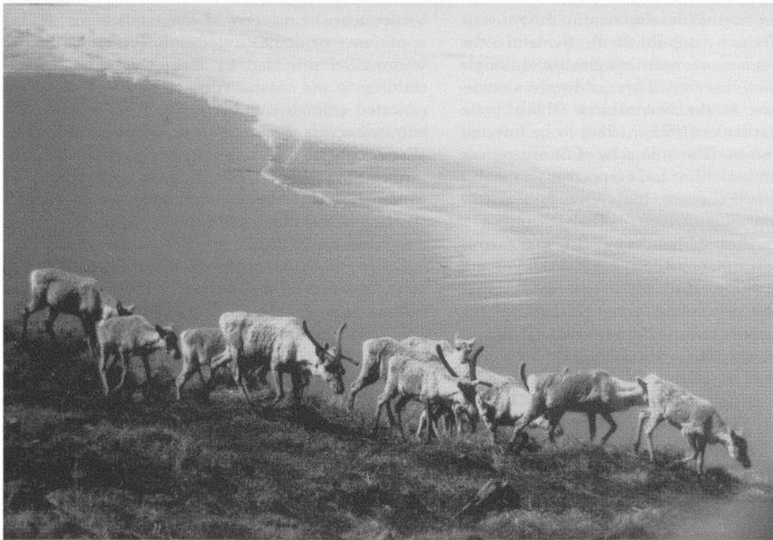
Fig. 2. Wild reindeer, mature males and younger animals, migrating northward along the eastern shore of Chandler Lake, in the central Brooks Range, late May.

likely to have disorders that hamper locomotion, they are most vulnerable to predation by wolves. They also have a higher rate of infection by the