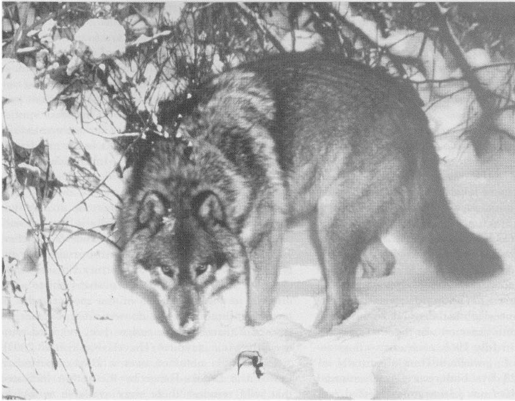
Fig. 1. Wolf, Canis lupus , from south-central Alaska.