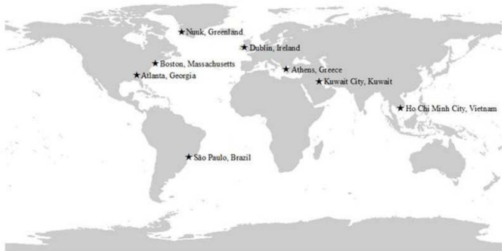
Fig. 1. Map of study cities