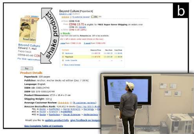
Figure 5. Proxemic Peddler. Left: Attention-attracting animation slows if passerby gazes at display. Right: Product graphic shakes to re-attract attention if person turns away [30].

While the above examples illustrate how proxemic displays can grab attention in an entertaining and perhaps subtle manner, they can also be obnoxious. An earlier version of the Peddler system [30] displayed flashing graphics and shouted out loud audio messages to the passerby. The more the display was ignored, the more insistent it became. The Black Mirror episode mentioned previously includes an extreme example of a fascist Attention Grabber pattern within the context of a Captive Audience pattern: the display wall shown in Figure 3 detects when the person is trying to shut out the displayed information by sensing if that person's eyes are closed, or turned away. If so, it plays increasingly annoying sounds and messages to force the person to look at the content.