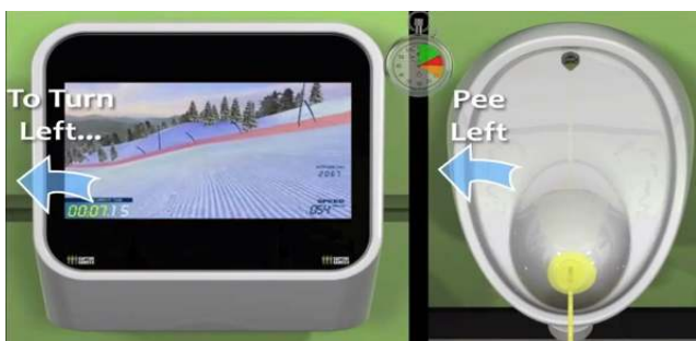
Figure 2. Captive Media screenshot (YouTube ID: XLQoh8YCqo4#t=44), © Captive Media, with permission.

As another example, BBDO Düsseldorf and Sky GO developed a device that can transmit audio advertisements to commuters resting their head against the train window. Commuters suddenly hear an advertisement that is inaudible to other passengers and sounds like a voice in their head. The transmitter works by sending high-frequency vibrations through