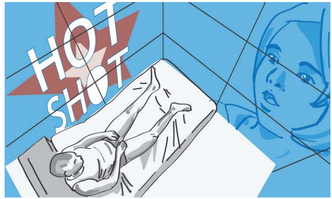
Figure 3. Scene from Black Mirror (sketch by David Ledo).

the window, which are then picked up in the commuter’s inner ear using bone conduction.