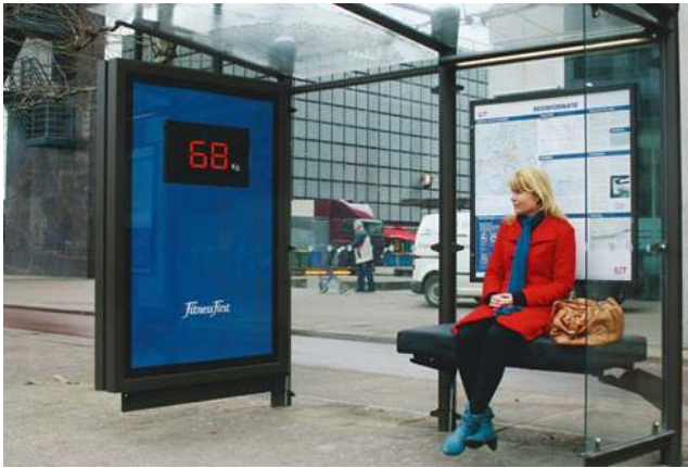
Figure 7. The Fitness First health club display.

stop's wall. Its purpose is purportedly to motivate people to join the health club by intentionally publicizing their weights and offering them a price reduction fee of their weight in Euro's in return.