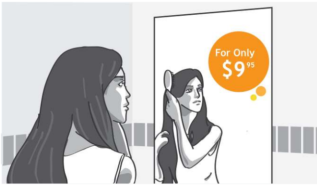
Figure 1. Novo Ad screenshot (sketch by David Ledo).

woman becomes the captive audience, as her primary task is to use the sink and mirror for grooming. The video ad, which starts on her approach, is the unsolicited system action. Other captive locations listed by Novo Ad include dressing rooms and elevators.