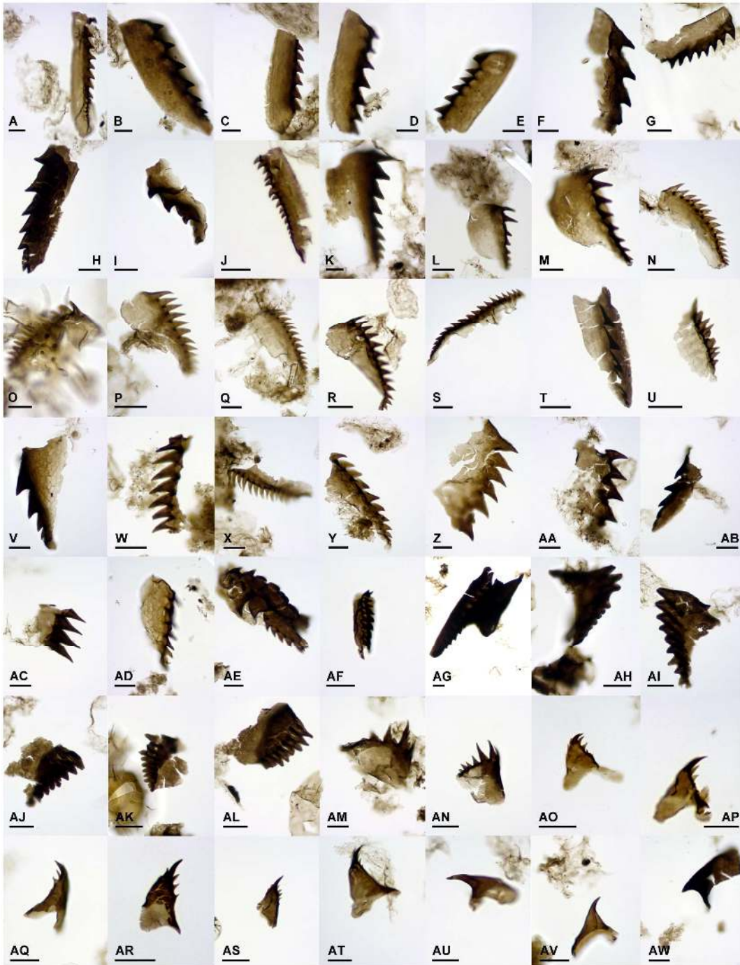
Fig. 3. Photomicrographs of selected representative scolecodonts recorded from Kinnekulle, Västergötland, southern Sweden. Scalebar 20 \mu m. A–I. Placognath jaws tentatively assigned to mochttyellids, specimens probably represent first maxillae. A. LO 12339t-a, HÄ12-9. B. LO 12340t-a (possible xanioprionid), TH12-LHP. C. LO 12339t-b, HÄ12-9. D. LO 12341t-a, HÄ12-9. E. LO 12341t-b, HÄ12-9. F. LO 12342t-a, HÄ07-7. G. LO 12343t-a, HÄ07-7. H. LO 12344t-a, HÄ07-4. I. LO 12341t-c, HÄ12-9. J. First maxilla(?), ctenognath?, LO 12342t-b, HÄ07-7. K–M. Possible ctenognath (tetraprionid) right maxillae; K. LO 12345t-a, HÄ07-1. L. LO 12343t-b, HÄ07-7. M. LO 12346t-a, HÄ07-1. N–S. First maxillae (some might represent basal/laeobasal ridges). Mochttyellid, tetraprionid and/or Lunoprionella -like jaws. N. LO 12341t-d, HÄ12-9. O. LO 12341t-e, HÄ12-9. P. LO 12346t-b, HÄ07-1. Q. LO 12345t-b, HÄ07-1. R. LO 12343t-c, HÄ07-7. S. LO 12344t-b, HÄ07-4. T–AD. Unidentified scolecodonts of probable placognath/ctenognath affinity. T. LO 12344t-c, HÄ07-4. U. LO 12344t-d, HÄ07-4. V. LO 12340t-b, TH12-LHP. W. LO 12347t-a, TH12-LHP. X. LO 12341t-f, HÄ12-9. Y. LO 12341t-g, HÄ12-9. Z. LO 12345t-c, HÄ07-1. AA. LO 12339t-c, HÄ12-9.