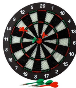
Figure. 1 Equipment of darts game

In this section, the potential of Darts game is