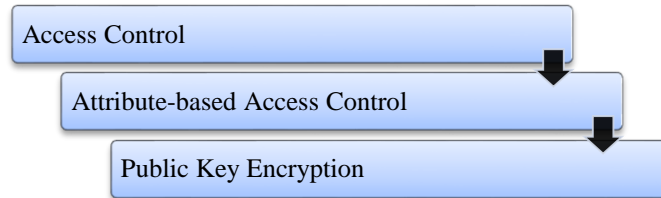
Fig. 2. Key schemes of the privacy preserving and public auditing

Figure 2 illustrates three key schemes of the privacy preserving public auditing. It is noted well that the majority of models for privacy preserving public auditing, exposed in Table 1, depend on the three schemes: access control, attribute-based access control, and public key encryption. The following sections review the main features of each scheme.