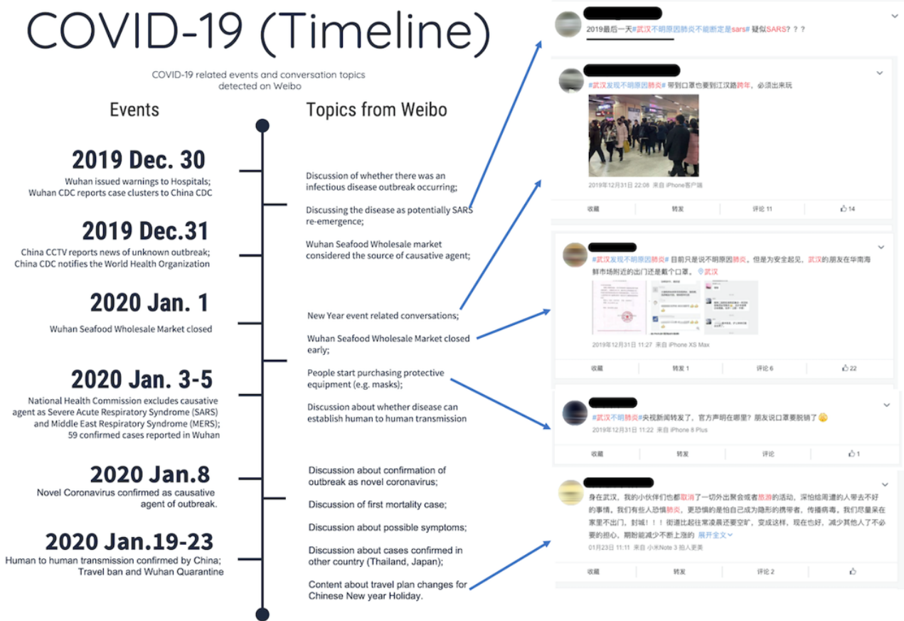
Figure 2. Timeline of COVID-19 events, themes detected in Weibo posts, and examples of posts. CCTV: China Central Television; CDC: Centers for Disease Control and Prevention; COVID-19: coronavirus disease.