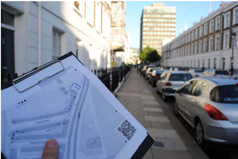
Figure 2 – Walking paper.

To understand the lack of mobilization of the volunteers, it is important to have a clearer idea of what kind of an activity mapping is. OSM is generally presented as a platform where everyone, once registered, should be able to contribute. To take part in drawing the map, one does not need expensive tools: the basic process is to print the area to be mapped on “walking papers” (figure 2) and start listing the items lacking in the public space, whether those items would be buildings and roads, or traffic lights, trees and pedestrian crossings. To help her in her task, one could use a GPS or smartphone, to record geographical position and take pictures of the area.