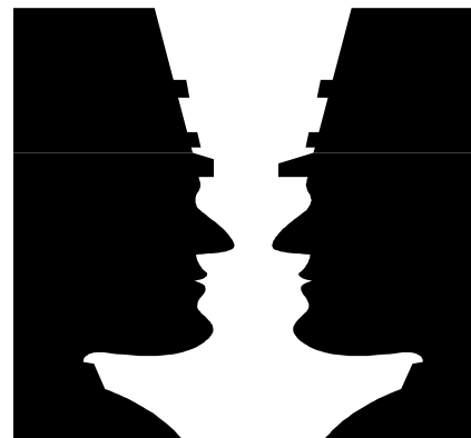
Figure 1: Data or Software?

Data reverse engineering (DRE) grew up through two different (and for the most part exclusive) communities: 1) the database community and 2) the software engineering community. The way DRE was performed and which aspects of DRE were emphasized differed as much as the focus of the two communities differed. To illustrate, we can use the technique of “figure/ground” shown in Figure 1. What do you see: Vase or faces--Data or software?