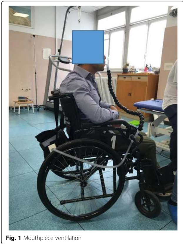
Fig. 1 Mouthpiece ventilation

209 patients, 30 using MPV modes, by questionnaire. These patients associated mouthpiece NVS with less dyspnoea and fatigue and greater facility in speaking and eating. In another study, Nicolini et al. [68] reported an improvement in clinical symptoms, blood gases, and in nocturnal ventilation, sleep related parameters and Health Related Quality of Live scores for kyphoscoliotic patients. While frequent or prolonged disconnections inducing apnoea/hypopnea or hypoventilation have been noted [63, 68], this only occurs when less than NVS settings are used.