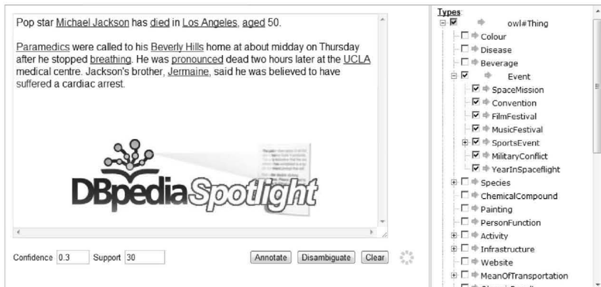
Figure 1: DBpedia Spotlight Web Application.

annotation is rather uninformative. An indicator for that is that it has only seven Wikipedia inlinks. With the support parameter , users can specify the minimum number of inlinks a DBpedia resource has to have in order to be annotated.