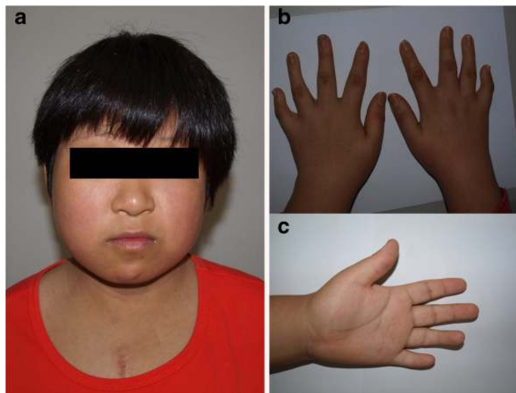
Fig. 1 The clinical features of the patient. a Frontal view of the patient, showing facial asymmetry, high prominent forehead, small eyes, ocular hypertelorism with droopy eyelids, epicanthal folds, flat nasal bridge, thin upper lip, short neck, and broad thorax. b, c Small hands, the fifth finger bending and brachydactyly

G-banding (400–550bands) was performed on metaphase chromosomes of cultured peripheral blood lymphocytes obtained from the patient and her parents. FISH analysis was performed according to the manufacturer's instruction ( www.abbottmolecular.com ), and the images were captured using a Leica DM500B camera and Leica CW400 software (Applied Imaging). Three bacterial artificial chromosome (BAC) clone probes specific for the region 11p15.4 (RP11-89B9, red), the 11q25 (RP11-7 K8, green), and 21q22.3 (RP11-135B17, orange) were applied. To determine the presence of telomere regions in r(11) and the derivative chromosome 21, FISH using telomere region-specific probes Mix #4 and Mix #11 (Vysis ToTelVysion Multi-Color FISH probe, Abbott, U.S.) was performed. Mix #4 contains specific probes for 4p(chr4: 86938, Spectrum Green), 4q(chr4: 190049608, Spectrum Orange) and 21q(chr21: 47931911, Spectrum Green and Spectrum Orange). Mix #11 contains specific probes for 11p(chr11: 199260, Spectrum Green), 11q(chr11: 134643494, Spectrum Orange) and 18p(chr18: 140409, Spectrum Green and Spectrum Orange).