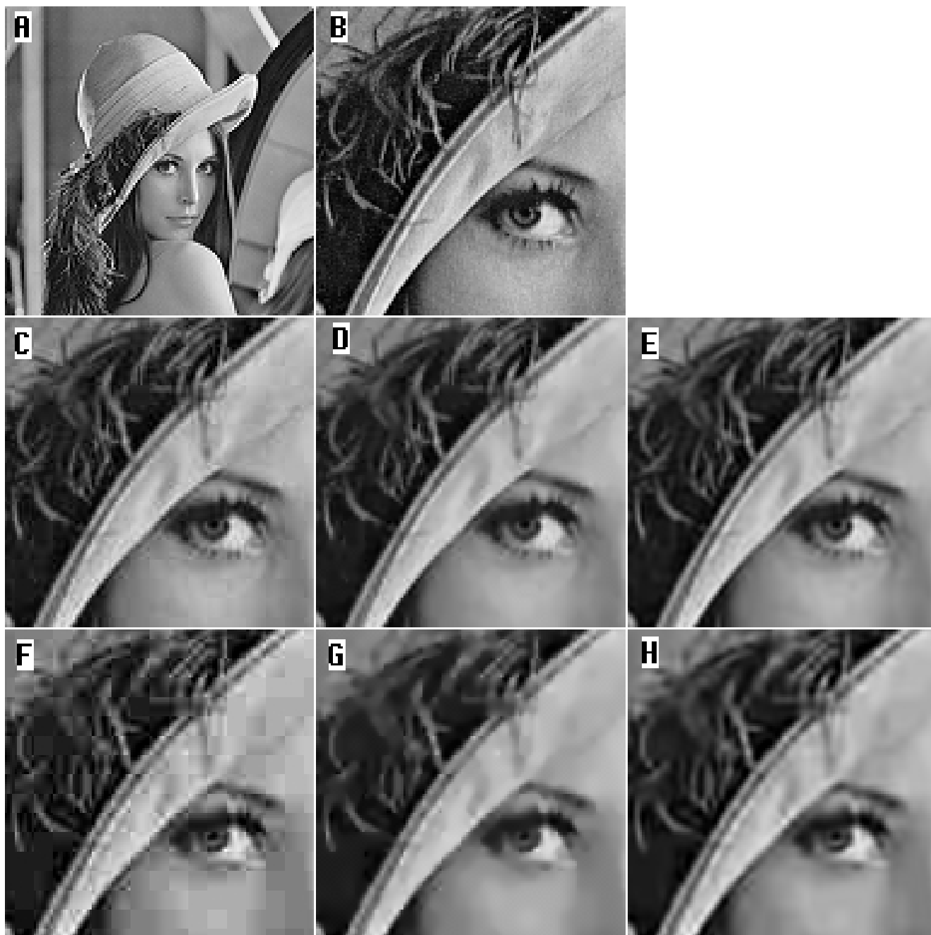
Fig. 2. Results on Lena. A : Original 512 \times 512 , 8 bpp image; B : zoom 4x of the original image; line C-D-E : JPEG compression at CR=15; C : standard decomposition (PSNR=33.72); D : weighted-TV algorithm (PSNR=34.34, K = 2 , CPU=0.43 sec.); E : Nosratinia's algorithm (PSNR=33.95, CPU=6.15 sec.); line F-G-H : JPEG compression at CR=30; F : standard decomposition (PSNR=29.22); G : weighted-TV algorithm (PSNR=30.42, K = 10 , CPU=1.19 sec.); H : Nosratinia's algorithm (PSNR=30.13, CPU=6.06 sec.). On printed paper it is not very easy to distinguish differences between weighted-TV and Nosratinia's restored images, but on a high resolution screen one can see that Nosratinia's images are slightly blurred. If the speed of Nosratinia's algorithm is about the same whatever the CR is, our algorithm goes slower when the CR grows since more iterations K are required. However, our method remains much faster than Nosratinia's one. CPU spent in second are given for a Pentium IV processor at 2.40Ghz, without any optimization and with identical DCT/IDCT software code.