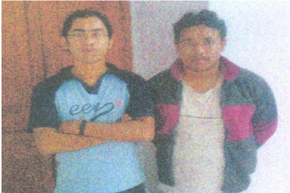
Figure6. Restoration of Blurred, Noisy Image Using Estimated SNR