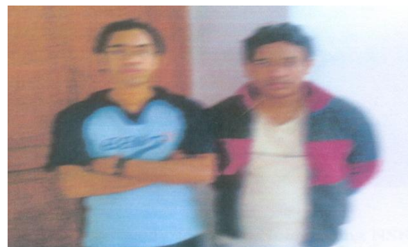
Figure4. Simulated Blur and Noise