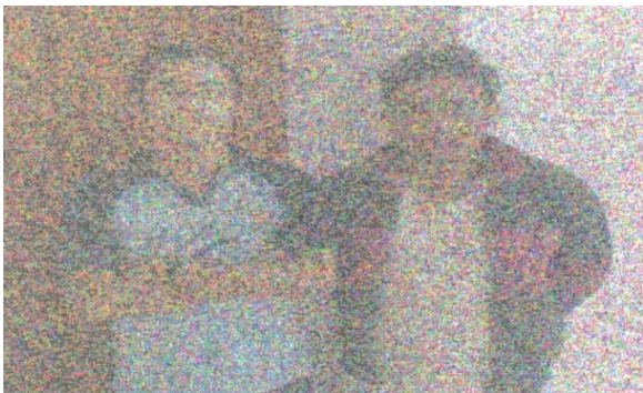
Figure7. Restoration of Blurred, Quantized Image Using SNR=0