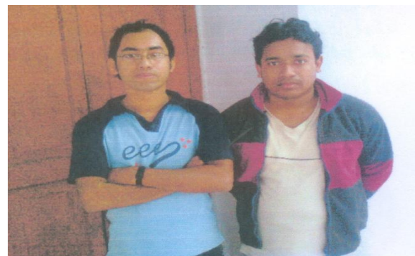
Figure3. Restored Image