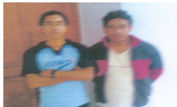
Figure2. Blurred Image