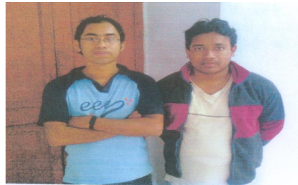
Figure1. Original image