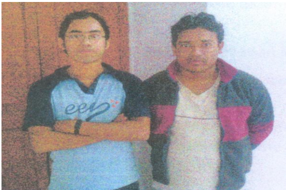
Figure8. Restoration of Blurred, Quantized Image Computed SNR