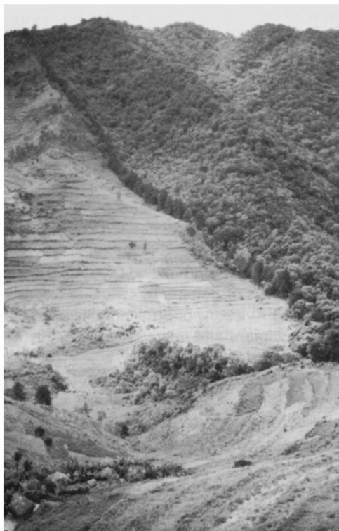
Visible land pressures: the boundary of the Impenetrable Forest Reserve ( G. M. Tabor ).

often forgotten in their roles as protectors of water supplies and soils, stabilizers of local climates, sources of food and medicines, and so on. Such factors do not fit easily into a cost-benefit analysis and can imply a timescale of benefits that is impossible for human developers to visualize (Leslie, 1987). Sawn timber has the benefit of being tangible and of considerable value in hard currency; charcoal is needed here and now. But should these take priority over all else? The case for the preservation of all or most of Uganda's remaining forests rests on two points; the unknown effects and possible unsustainability of forest management operations, and the largely unrecognized potential for tourism.