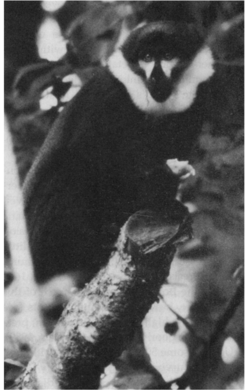
L'hoests monkey Cercopithecus lhoesti , one of up to nine higher primates found in medium-altitude forests (G. M. Tabor).

If harvested forest can be managed in a way that is sustainable in the long term, in the sense of sustaining the ecosystem as well as the timber yield, then the forests will certainly