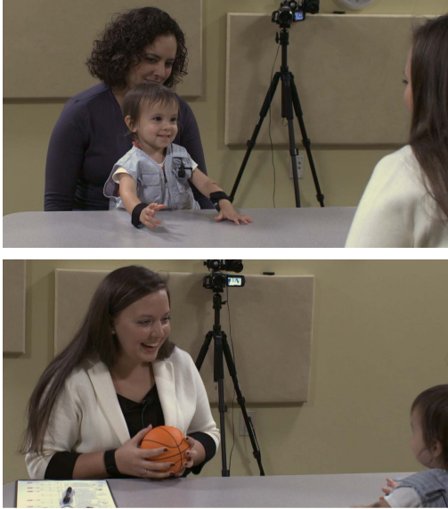
Figure 1. Child and examiner camera views in the MMDB dataset

is a child-friendly 300-square foot laboratory space which is equipped with the following sensing capabilities: