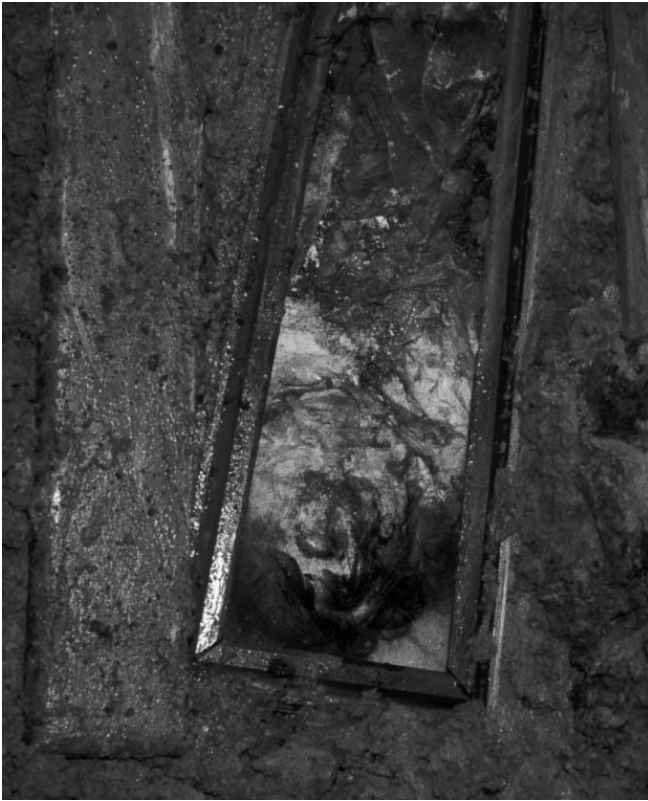
Fig. 2 Corpses showing the uniform formation of adipocere in an earth grave

aerobic and dry surroundings. Therefore, these authors concluded that moisture was not an essential prerequisite for adipocere formation. Water is necessary for the general bacterial and enzymatic activities involved in adipocere formation; however, there seems to be enough water stored in the fatty tissue of the corpses (Janaway 1987). Insufficient gas circulation slows down post-mortem changes because the degrading bacteria die (Müller 1914; Schoenen 2002) due to oxygen deprivation, acidity, amines or other end-products which affect the pH or membrane functions.