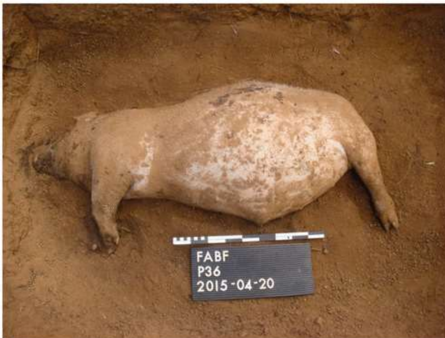
Figure 2. Pig 36 exhibiting bloating of the abdomen with relatively fresh skin after 7 days of interment.