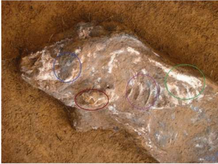
Figure 6. Pig 4 showing the black skin–soil interface and desiccated tissue on the skull (blue), a disarticulated front limb (brown), visible rib cage (purple) and adipocere/grease formation on the spine (green).