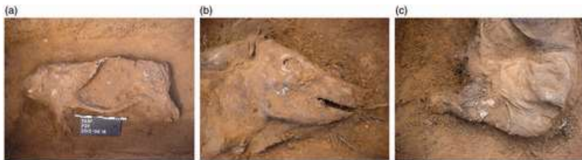
Figure 5. Collapsed abdomen (a), partial skeletonisation of the head (b), adipocere formation on the back extremity and leathery skin (c).

After 92 days post mortem, pigs showed black skin–soil interface on the majority of the remains. Only two pigs displayed pink and black patches on the extremities and head. All remains within this time frame exhibited a mild ammonium smell, partial skeletonisation of the head, adipocere formation, collapse/flattening of the trunk, disarticulated hooves and very leathery skin (especially on the vertebrae) (Figure 5). TBS ranged between 19 and 21, (averaging 20.4) indicating a narrow range when comparing TBS after 33 days of interment.