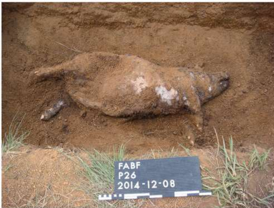
Figure 3. After 14 days PMI pigs displayed a deflated abdomen, dark discoloration on the head, purging fluids from the snout and skin slippage.

After 14 days post mortem, pigs displayed some common features associated with the early stages of decomposition with narrow TBS scores ranging between 13 and 14, averaging at 13.4. Pigs showed obvious sagging/deflation of the abdomen, a dark pink discoloration especially on the head, decomposition fluids purging out of the natural openings of the carcass and skin slippage on the extremities (Figure 3). A considerable putrid smell was noticeable from all carcasses in this time frame. In addition, all five graves caved in above the trunk area as soon as excavation started on the burial pits. The unstable surfaces for these graves were not evident before excavation started. This secondary depression of the burial pits is caused by the collapse of the abdomen during the decomposition process.