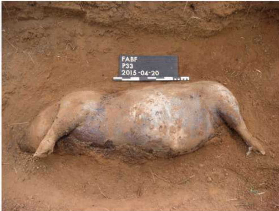
Figure 1. Pig 33 exhibiting bloating of the abdomen with dark discoloration of the abdomen after 7 days of interment.

After a PMI of 7 days pigs exhibited variations in the decomposition process and the TBS scores ranged between 8 and 11, averaging at 9.6. All pigs within this time frame had a mild odour that is associated with the early stages of decomposition. 11,21,25 Three pigs showed a very dark purple and grey discoloration on the lower abdomen and trunk and oily skin (Figure 1), whereas the remaining two pigs in this time frame had a fairly fresh pink skin on the abdomen with little to no discoloration (Figure 2).