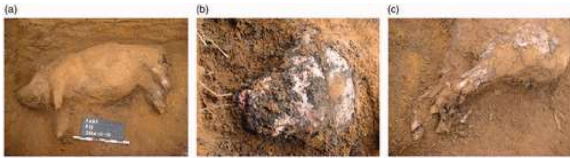
Figure 4. Bloating of the abdomen (a), adipocere formation, black soil-skin interface on the head, purging of decompositional fluid (b) and detached hooves (c) after 33 days of interment.

After 92 days post mortem, pigs showed black skin–soil interface on the majority of the remains. Only two pigs displayed pink and black patches on the extremities and head. All remains within this time frame exhibited a mild ammonium smell, partial skeletonisation of the head, adipocere formation, collapse/flattening of the trunk, disarticulated hooves and very leathery skin (especially on the vertebrae) (Figure 5). TBS ranged between 19 and 21, (averaging 20.4) indicating a narrow range when comparing TBS after 33 days of interment.