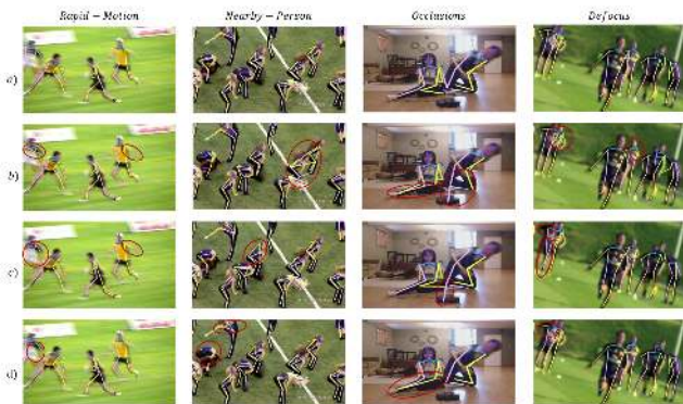
Figure 4. Visualization of the pose predictions of our DCPose model(a), SimpleBaseline(b), HRNet(c), and PoseWarper(d) on the challenging cases from the PoseTrack2017 and PoseTrack2018 datasets. Each column from left to right represents the Rapid-Motion, Nearby-Person, Occlusions, and Video-Defocus scene, respectively. Inaccurate predictions are highlighted with the red solid circles.

dilation rates, from 81.7 \rightarrow 81.9 \rightarrow 82.7 \rightarrow 82.6 \rightarrow 82.8 . This is in line with our intuitions that increasing the depth and scope of the effective receptive fields, i.e. , by varying the range of dilation rates, the Pose Correction Network is able to model local and global contexts more efficiently, leading to more accurate estimations of the joint locations.