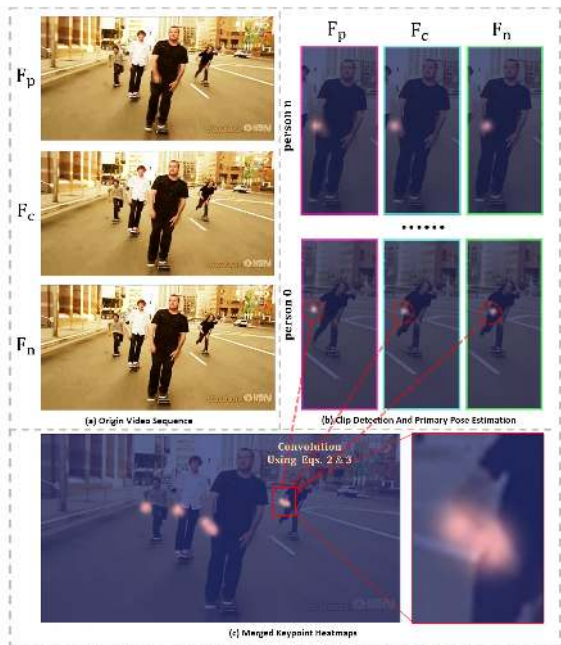
Figure 1. An illustration of our Pose Temporal Merger (PTM) network. (a) : Original video sequence in the datasets, and we aim to detect poses in the current frame F_c . (b) : Each person in the original video sequence is assembled to a cropped clip and a single-person joints detector gives preliminary estimations of keypoint heatmaps (illustrated for right wrist). (c-left) : Merged keypoint heatmaps for the right wrist, generated by our PTM network through encoding the keypoint spatial contexts. The color intensity encodes spatial aggregation. (c-right) : Zoomed-in view of the merged keypoint heatmaps.

is severely hindered in the case of occlusion commonly occurring in multi-person pose estimation and even self-occlusion in the single-person case. [39] proposes a 3DHR-Net (extension of HRNet [33] to include a temporal dimension) for extracting spatial and temporal features across video frames to estimate pose sequences. This model has shown excellent results particularly for adequately long duration single-person sequences. Another line of work considers fine-tuning the primary prediction with high confidence keypoints from the adjacent frames. [31, 28] propose to compute the dense optical flow between every two frames, and leverage the additional flow based representations to align the predictions. This approach is promising when the optical flow can be computed precisely. However in cases involving motion blur or defocus, the poor image qualities lead to imprecise optical flows which translates to performance drops.