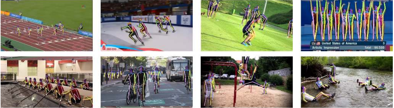
Figure 3. Visual results of our model on the PoseTrack2017 and PoseTrack2018 datasets comprising complex scenes: high-speed movement, occlusion, and multiple persons.

rection Network, we evaluate their contributions towards the overall performance. We also investigate the efficacy of including information from both temporal directions as well as the impact of modifying the temporal distance, i.e. , frame intervals between F_c and F_p, F_n . The results are reported in Table 5.